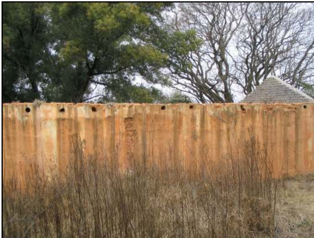
Figure 5: Structures similar to site 2