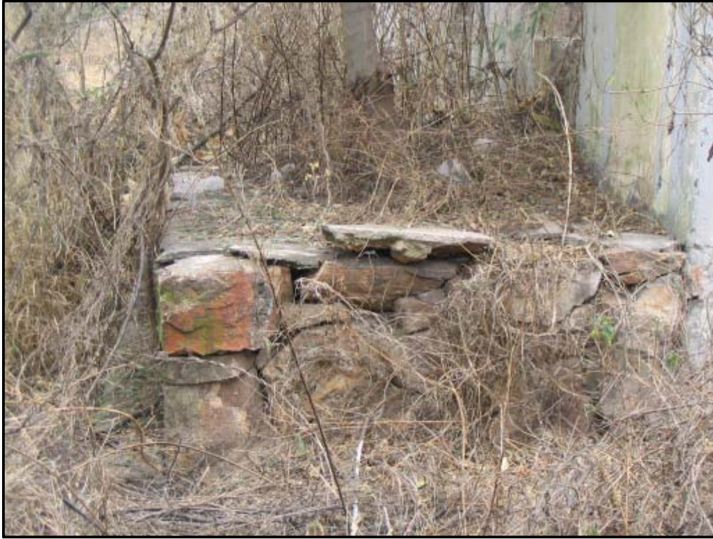
Figure 6: Stone foundations of veranda