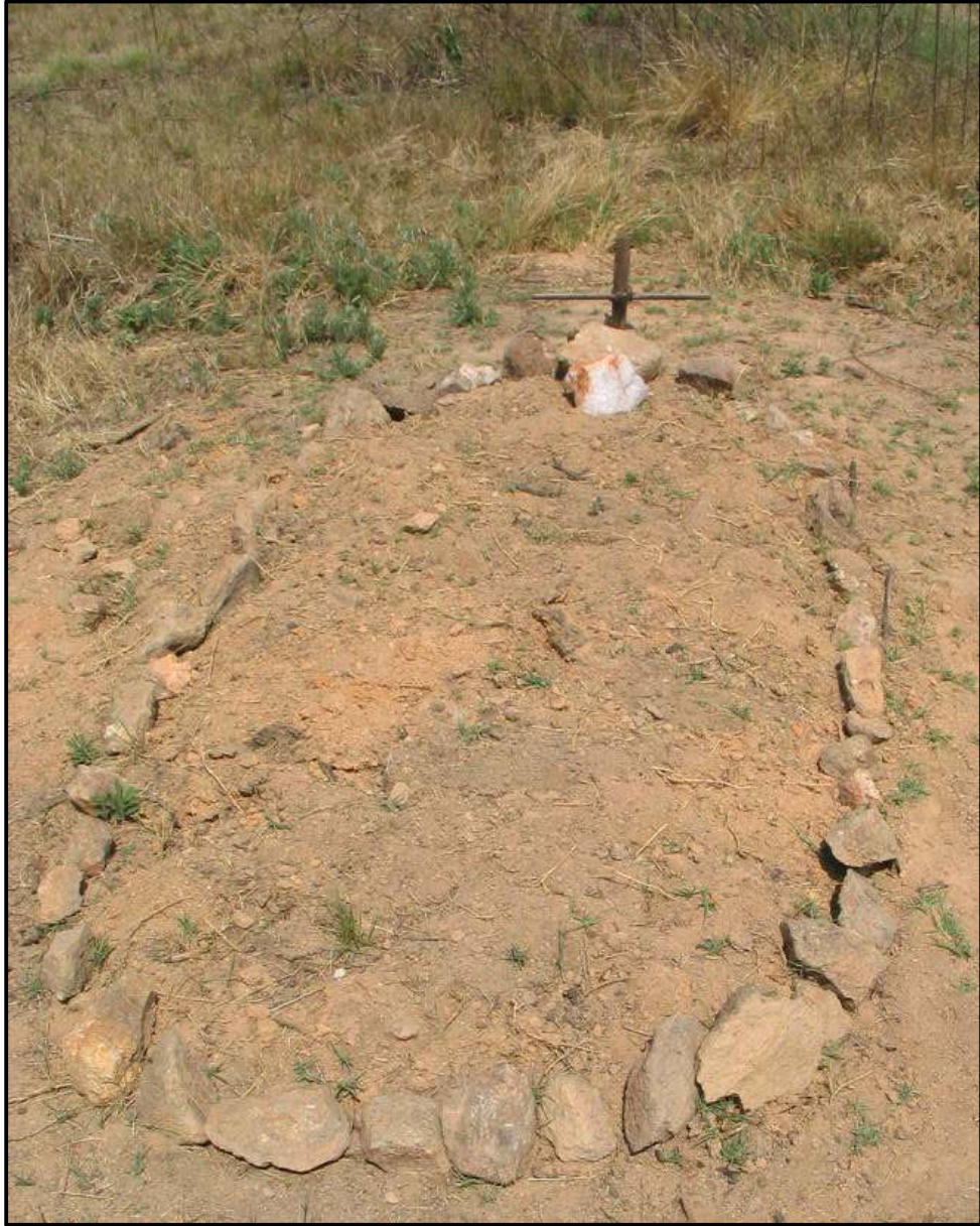
Figure 2: Informal grave