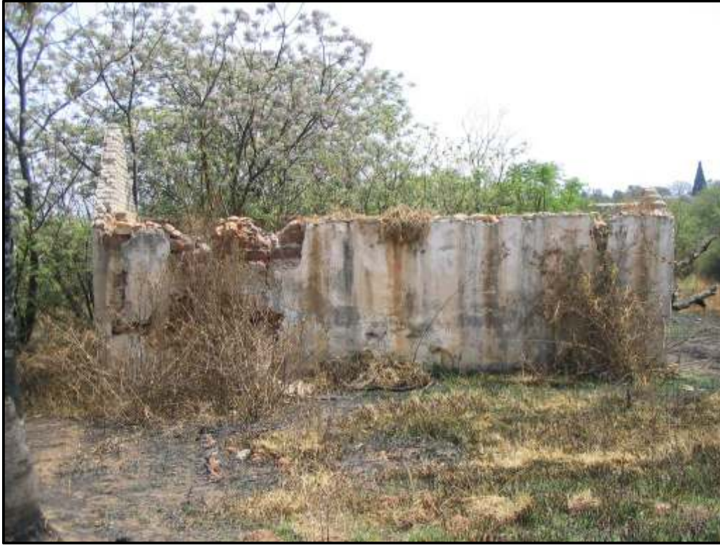
Figure 4: Dilapidated structures