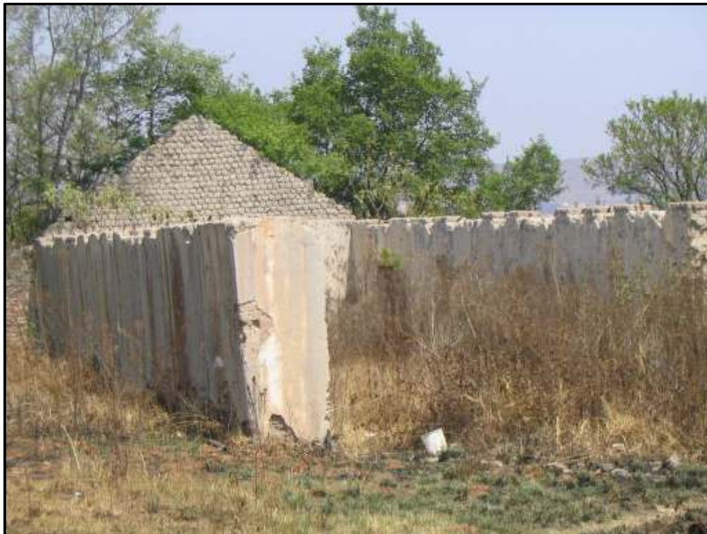
Figure 3: Dilapidated structures