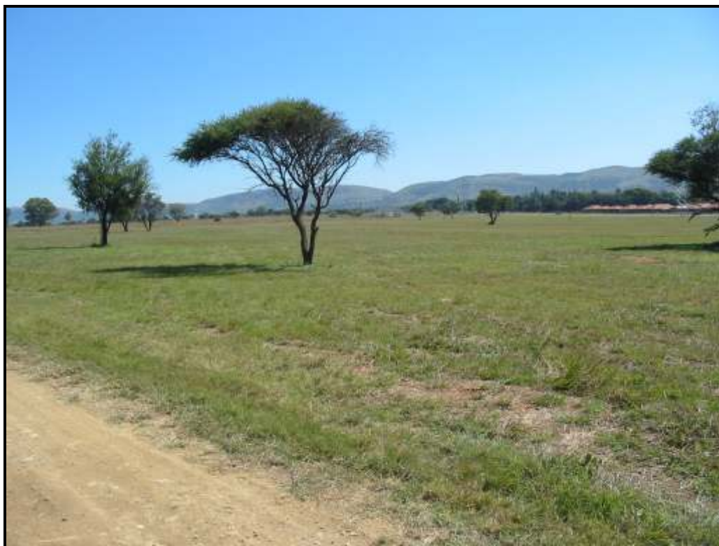
• Figure 2: General site conditions

Entrance to the site is from van der Hoff Street in Andeon Agricultural Holdings. No dwellings or structures exist on site. Ground visibility is high since the grass has been cut on the property.