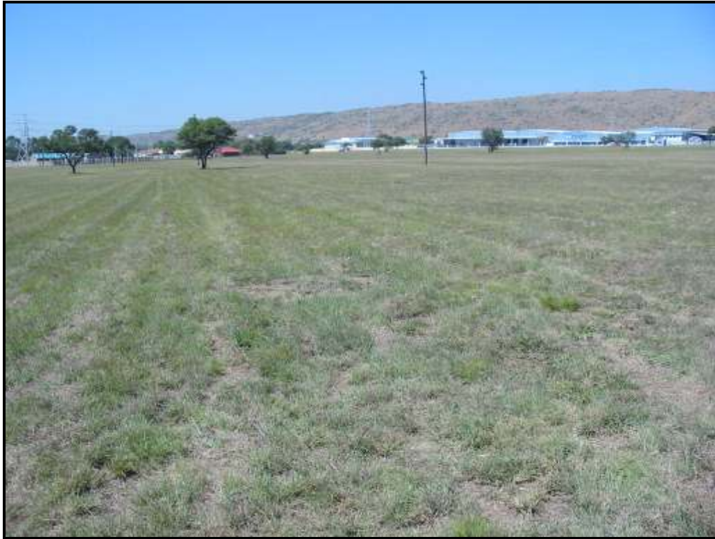
• Figure 3: General site conditions.