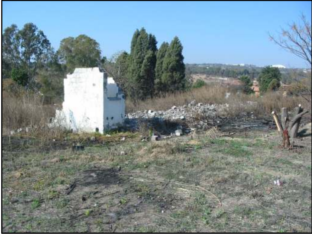
Figure 3: Demolished structures