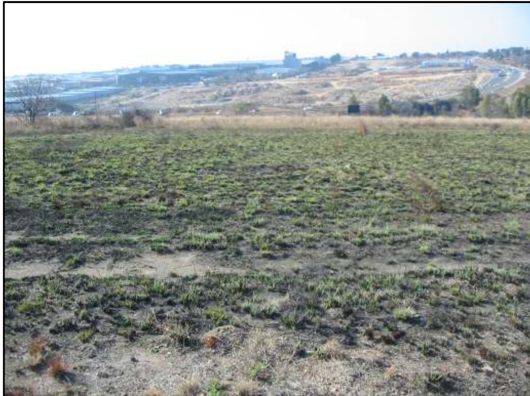
Figure 2: General Site Conditions

No heritage significant sites are located within the study area. Ground visibility is relatively high due to the burning of parts of the study area. Regular refuse dumping occur regularly on site and at least three modern dwellings have been demolished within the proposed development area.