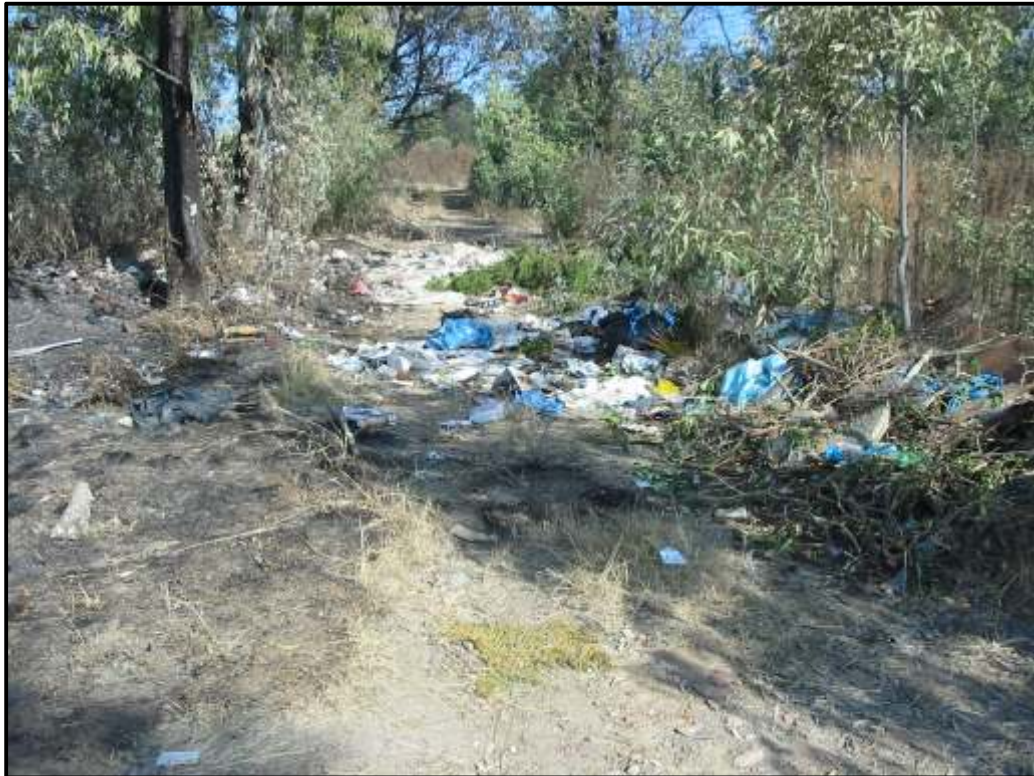
Figure 4: Regular refuse dumping.