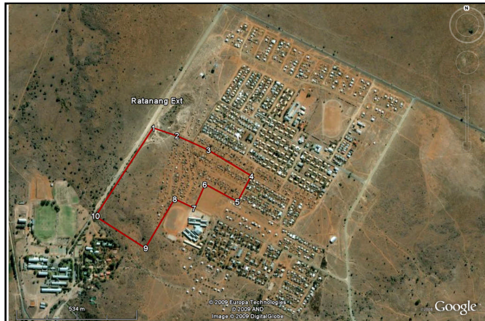
Figure 4: The Ratanang Ext Residential Development AIA assessed area

No archaeological or cultural heritage resources, as defined and protected by the NHRA 1999, were identified during the Phase 1 AIA of the approximate 17ha assessment area for the Ratanang Ext Residential Development near Jacobsdal in the Free State province.