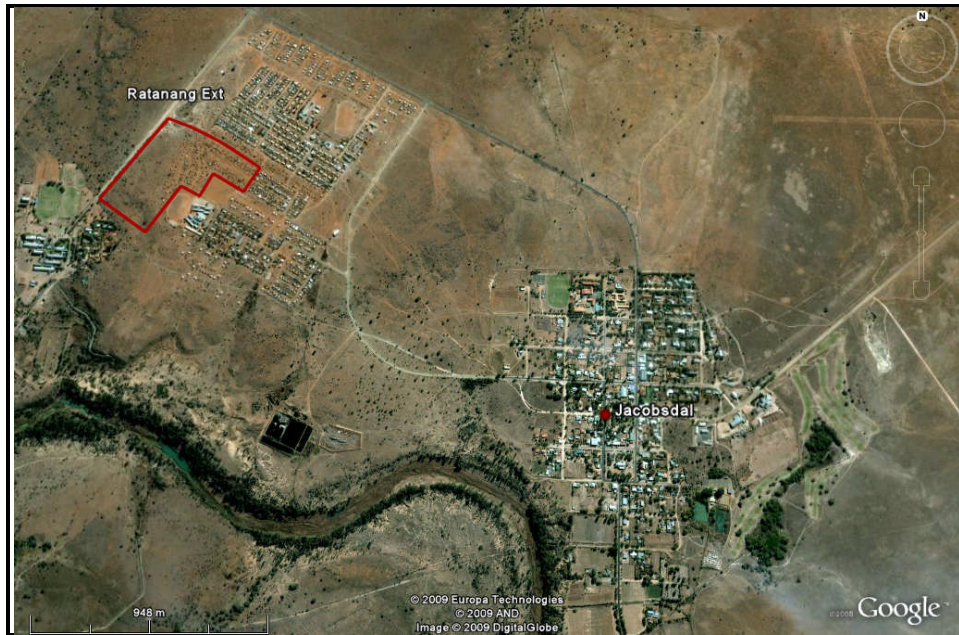
Figure 2: Locality of the proposed Ratanang Ext Residential Development in relation to Jacobsdal, Free State