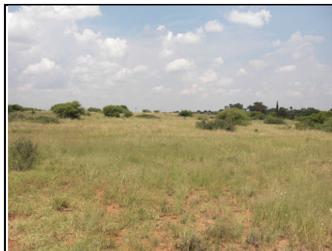
Figure 5: General view of the proposed Ratanang Ext Residential Development study site