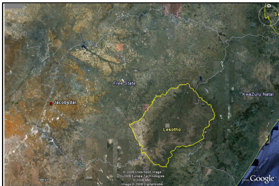
Figure 1: Jacobsdal, Free State, South Africa

Development impact will be total; resulting in the loss of surface and sub-surface heritage sites / features present in the areas.