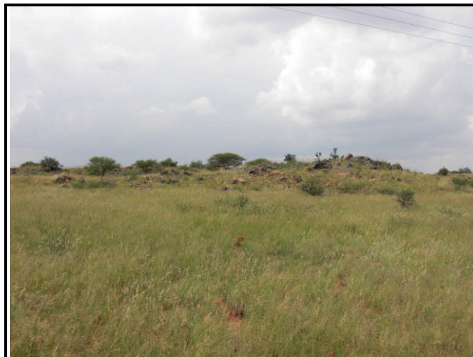
Figure 8: Dolerite outcrops at the Ratanang Ext study site (1)