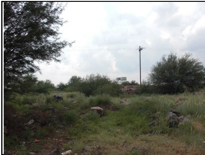
Figure 7: General view of the dumping and quarry area