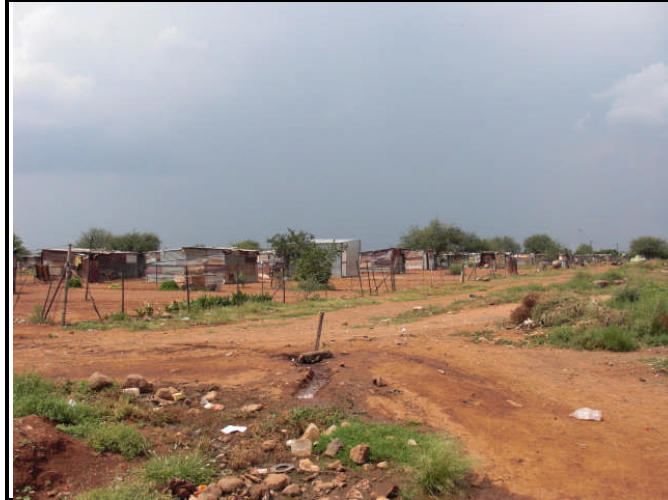
Figure 6: Existing informal settlement units at the study site