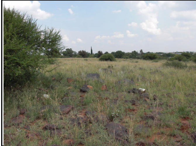
Figure 9: Dolerite outcrops at the Ratanang Ext study site (2)