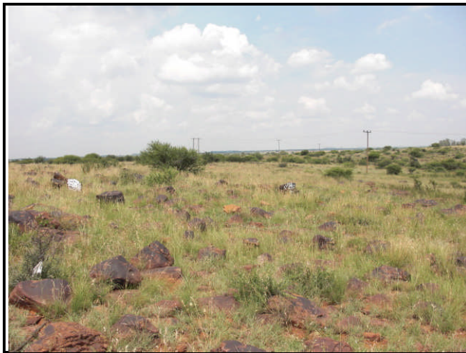
Figure 10: Contemporary graffiti at the dolerite outcrops