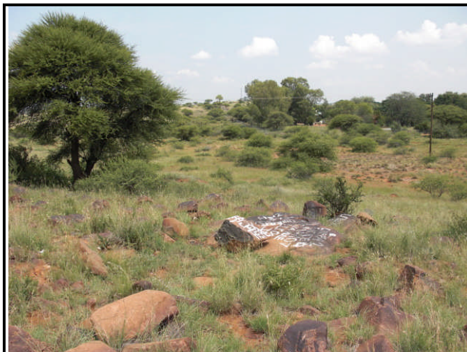
Figure 11: Close-up of a contemporary graffiti piece