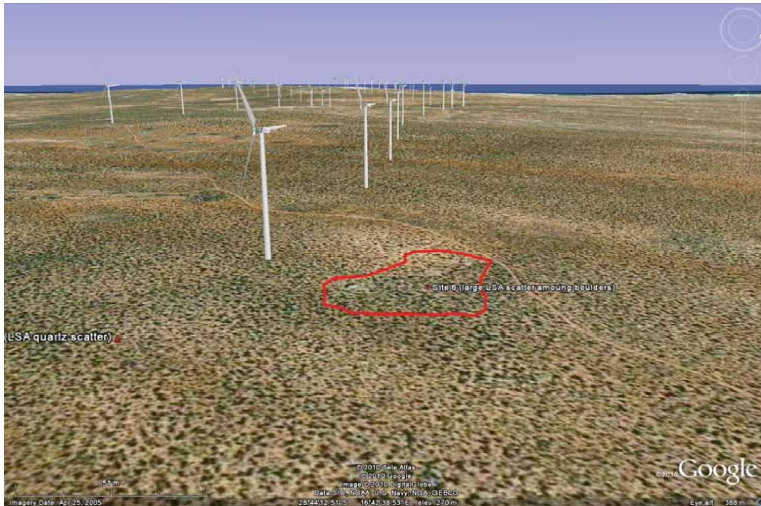
Figure 5. Google Earth 3-dimensional modelling showing archaeological site 6 relative to turbine rows.