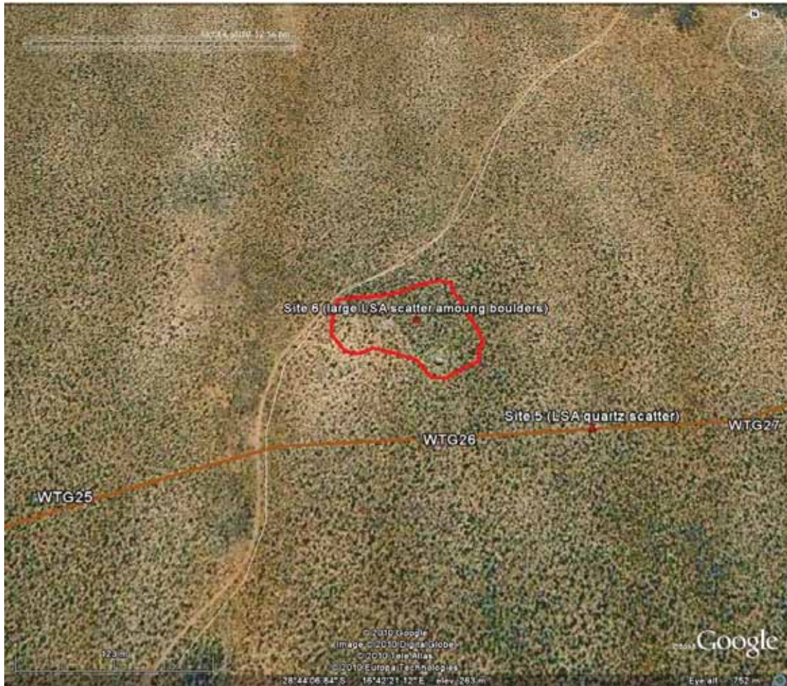
Figure 4. Sites 5 and 6 relative to the proposed turbine row.