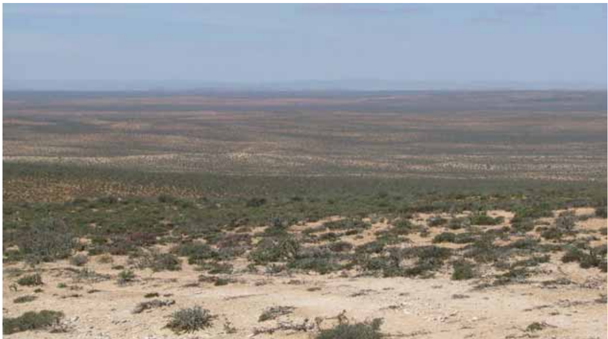
Plate 1. View from within the Study Area looking south east towards the escarpment.

In terms of aesthetics the area is open and desolate (Plate 1). The coastal strip (west of the provincial road) has been subject to intense diamond mining for most of the 20 th century. West of the R382 prospecting trenches, spoil heaps and bleak denuded areas litter the landscape. East of the R382 are the arid coastal lowlands consisting of large open tracts of sparsely vegetated dunes. While the Richtersveld is held in high esteem as a wilderness destination, the Study Area holds little interest and is seldom visited (if ever) by tourists.