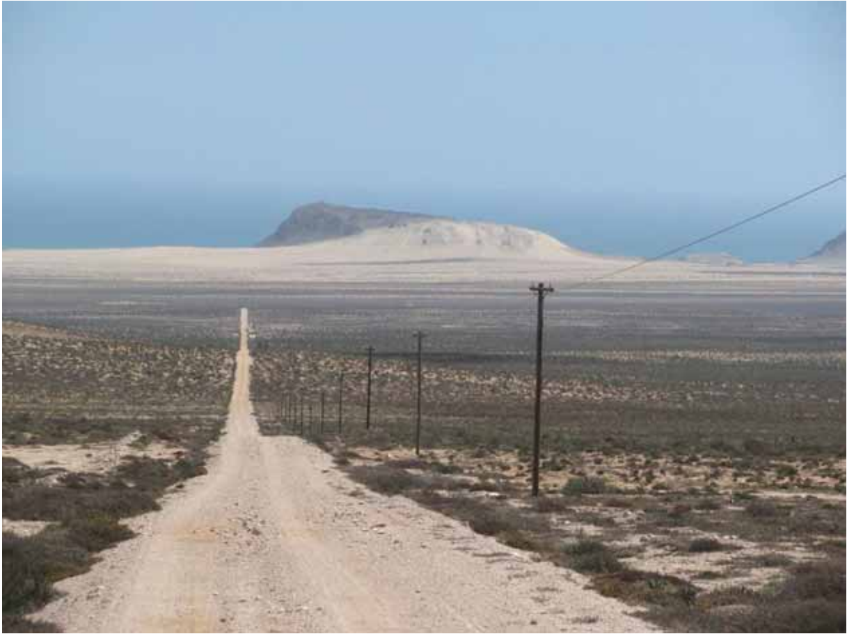
Plate 2. Looking in a westerly direction towards the Boegoeberg