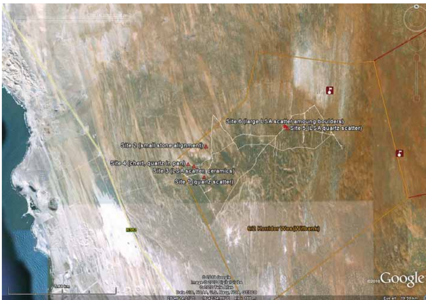
Figure 5. Locations of archaeological sites. The white lines indicate walk paths of the team.