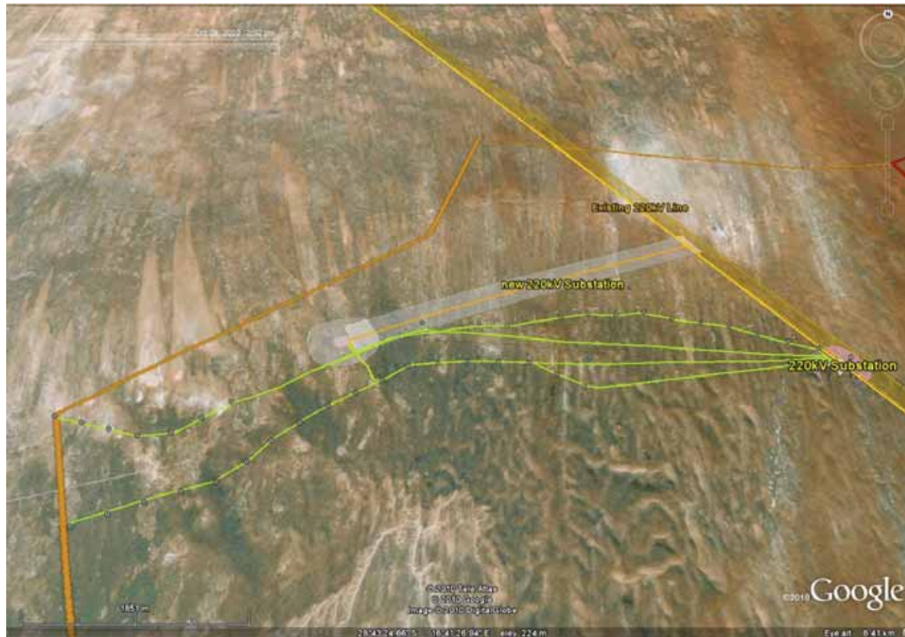
Figure 2. The proposed location of the 220 kV substation is in the central area of the site. This will be linked with existing Eskom 220 kV transmission lines by means of a small connecting substation.