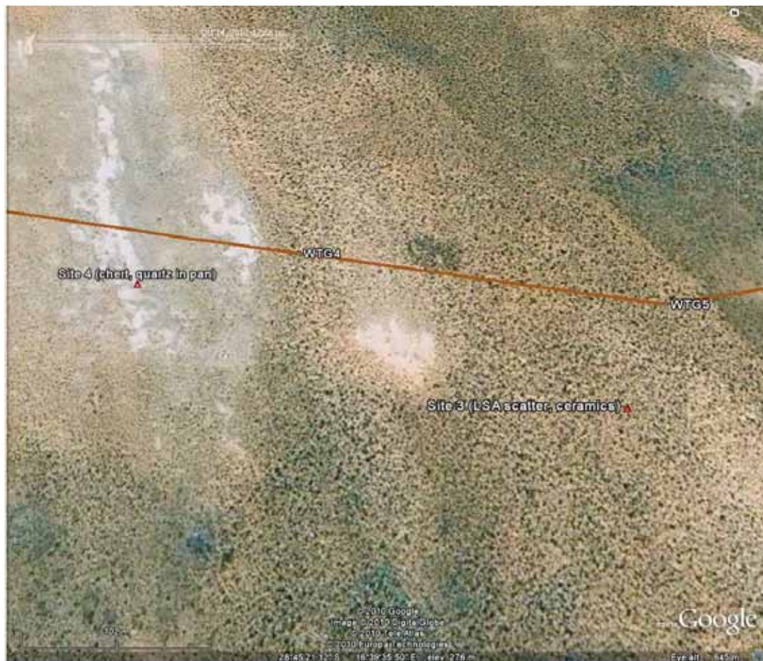
Figure 3. Locations of sites 3 and 4 relative to the access road and turbines wtg4 and wtg 5.

Site 6. The largest archaeological site (Figure 4), a Late Stone Age site predating the ceramic period which means that it is more than 2000 years old was found associated with the only significant granite outcrop in the Study Area. One of the larger granite boulders contained a natural water catchment hollow ( water bakkie ) which is why this locality was favoured as an encampment. The artefacts contained among them microliths (very small stone tools) and a strong retouched element suggesting that some of occupation took place during the formal phases of the Late Stone Age more than 3000 years ago. Although the site is some 14 km from the coast, the presence of small fragments of marine shell is an indicator that the shoreline was within the resource gathering range of the occupants of the site.