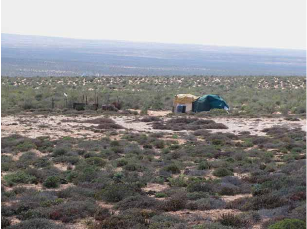
Plate 3. A typical stock post (Veepos) with hut, cooking area and kraal.