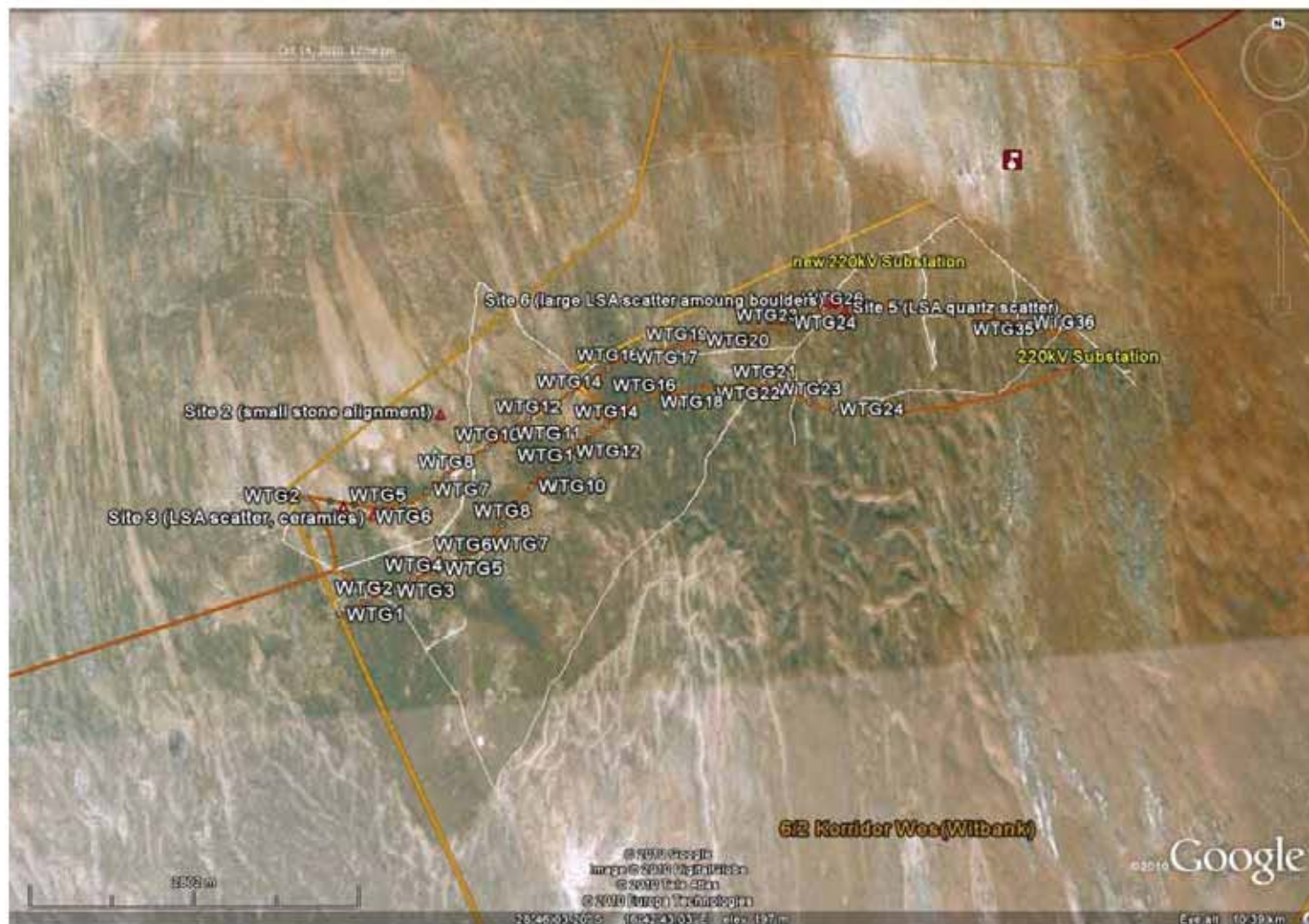
Figure 6. Location of archaeological sites relative to turbine positions.