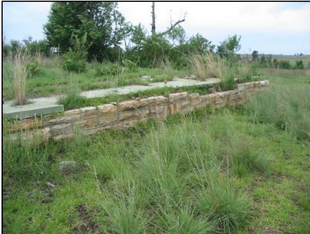
Figure 7: Sand stone foundations