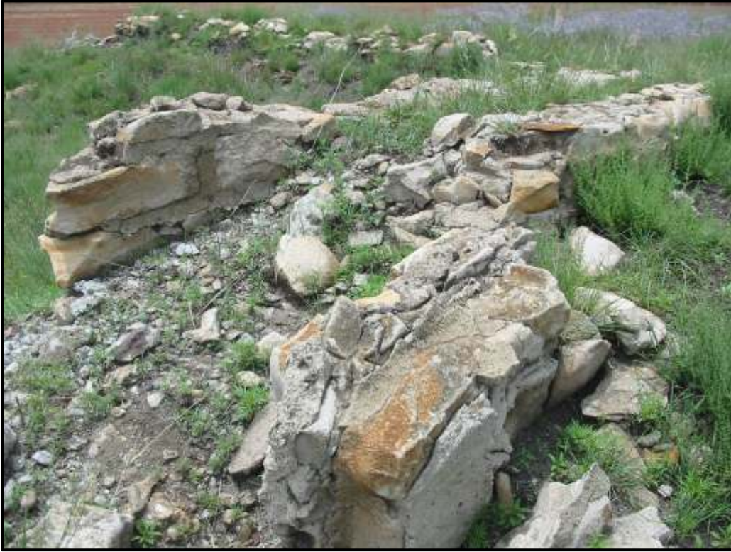
Figure 3: Sand Stone Foundations of shaft