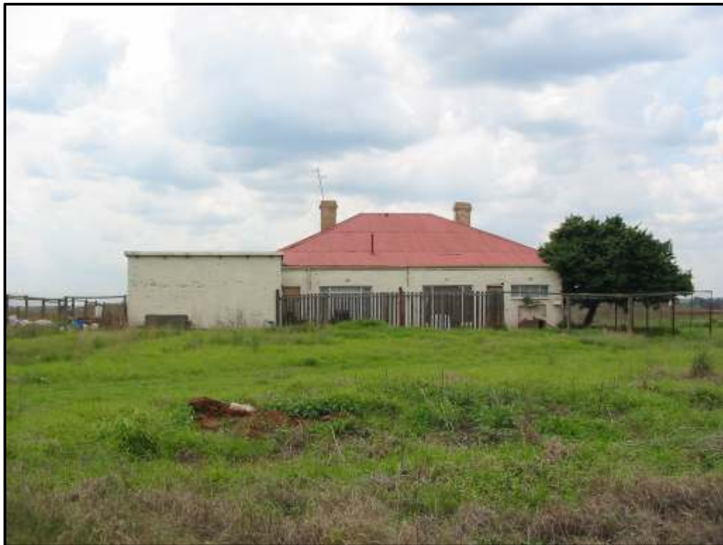
Figure 6: Historical Farm stead.