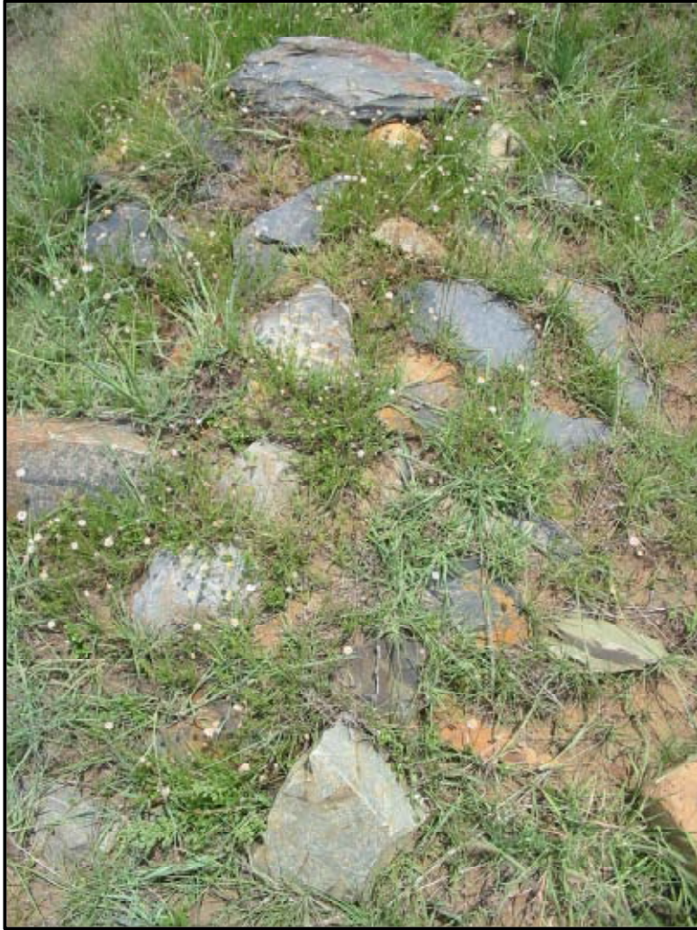
Figure 5: Stone packed grave dressings