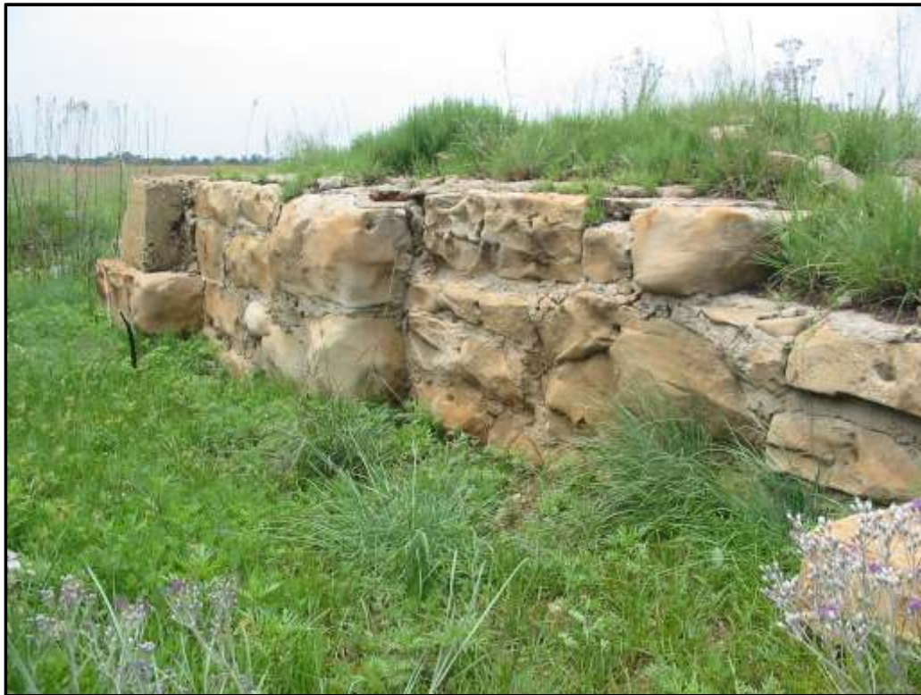
Figure 2: Sand Stone foundations of shaft