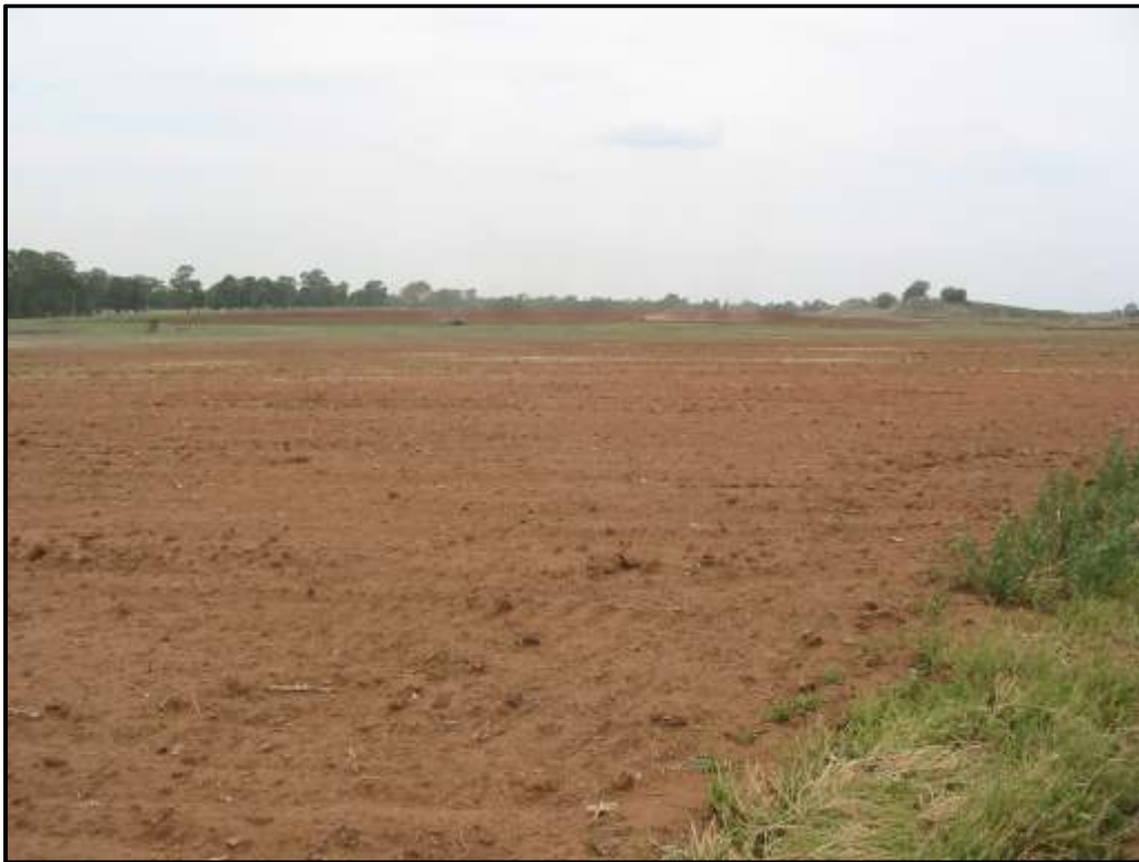
Figure 4: General site conditions