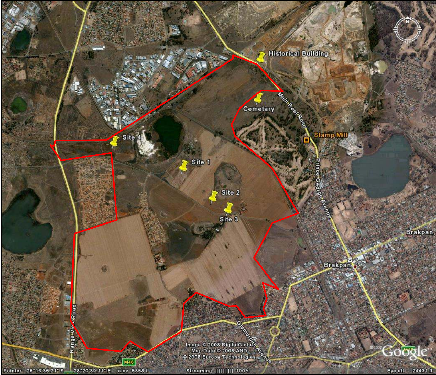
Image © 2008 DigitalGlobe Map Data © 2008 AND © 2008 Europa Technologies