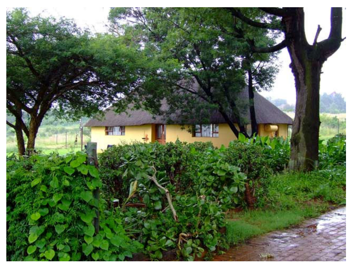
Figure 1: General view of site

No site of heritage significance is present on site (Refer to Figure 1 for general view of property.)