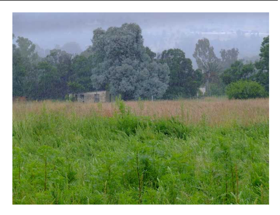
Figure 2: South-western section of site