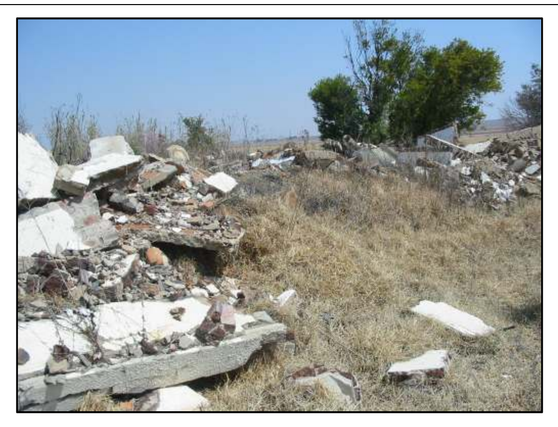
Figure 1: Demolished remains of house

Heritage significance: No sites of significance