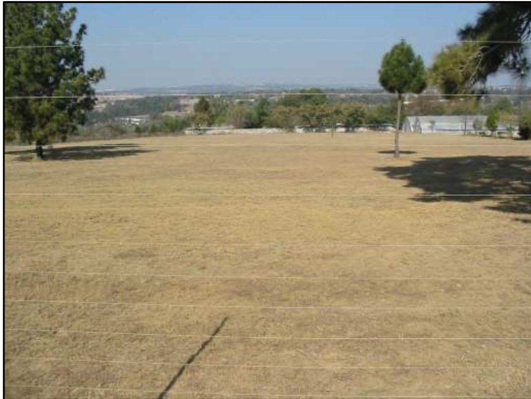
Figure 1: General Site Conditions

No heritage significant sites could be located within the study area. The grass within the study area has been cut and therefore ground visibility is high. The proposed school is located in close proximity to the intersection of Amazon and Lawerance Street at Coordinates S 26°00'07.08232" E 27°56'30.90520" .