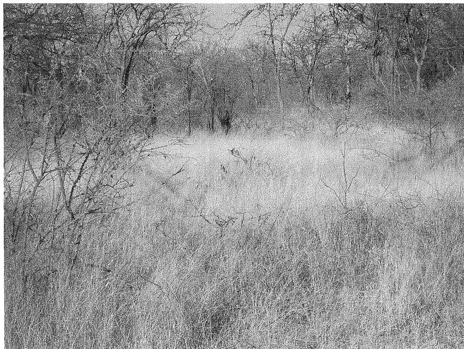
Figure 1: Proposed borrow pit site.

The borrow pit is situated at the km 10 from the junction of road D1200 and the beginning of D1468 from Senwabarwana to Indermark in the Blouberga Local Municipality of Capricorn District of the Limpopo Province. The borrow pit is found at GPS S23° 11' 143" E29° 06' 833". No signs of any heritage resources were observed.