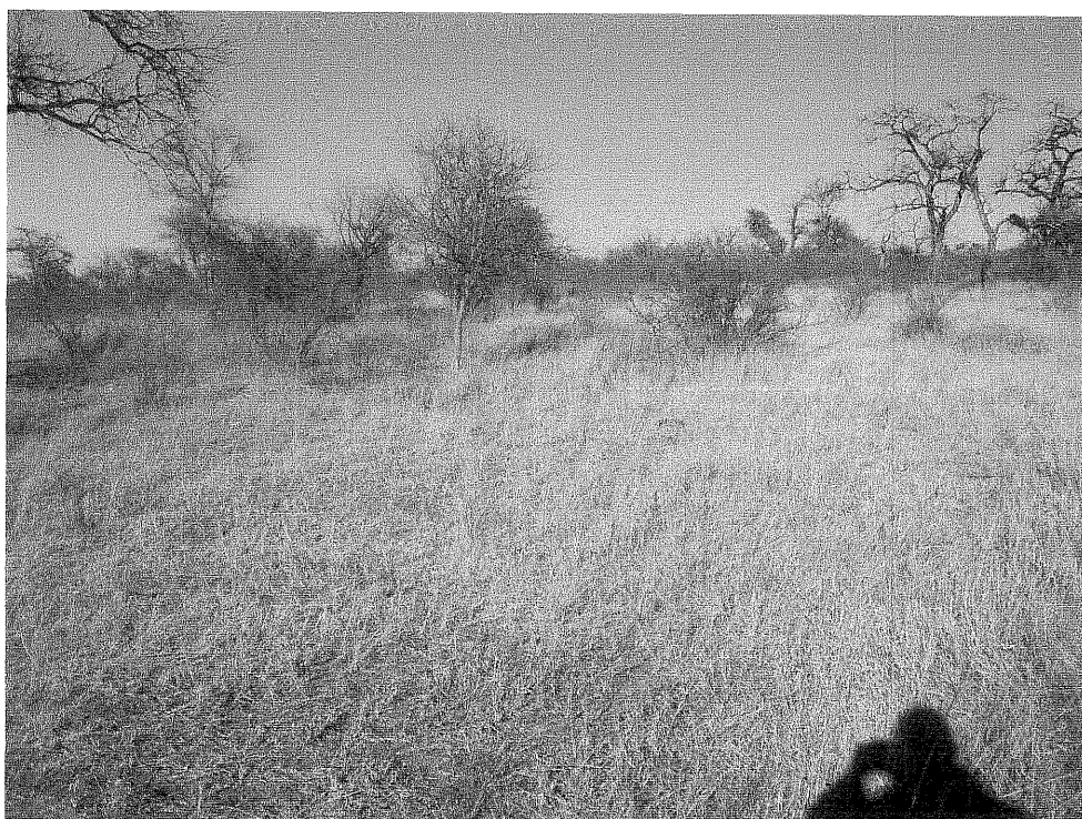
Figure 1: Proposed borrow pit site.

The borrow pit is situated at the km 16.6 from the junction of road D1200 and the beginning of D1468 from Senwabarwana to Indermark in the Blouberg Local Municipality of Capricorn District of the Limpopo Province. The borrow pit is found at GPS S23° 08' 121" E29° 07' 254". No signs of any heritage resources were observed.