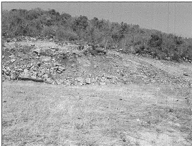
Figure 1: View of the proposed borrow pit #1 at Vhurivhuri area.

Proposed borrow pit #1 coordinates (GPS S22°43.042 E 30°45.912)