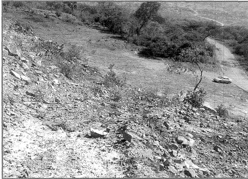
Figure 2: The proposed section of the existing borrow pit towards North western side.