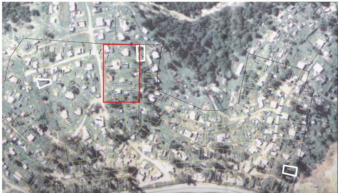
Figure 3: Aerial photography (2000) with cadastral boundaries superimposed. The erven outlined in white indicate where human remains have been found (erven 14124, 14159 and 14258). The approximate location of the Wesleyan burial ground is outlined in red.

Mr. Lombard, head of Knysna Municipal Housing at the time responded by saying that bones had been found and dug up - but that they had been placed in a coffin (after consultation with residents) and given to a Municipal cemetery official for re-burial in the Knysna Municipal cemetery. His response further states that Municipality had no record of there ever having been a burial ground in Flanders (Robololo) and that no formal objections regarding a burial site had been received from the public during the past 15-20 years of informal occupation of the Robololo site 1 .