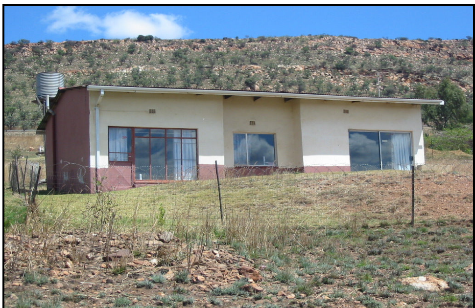
• Figure 2: Structure on site