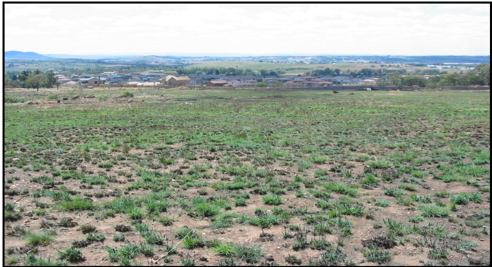
• Figure 1: General site conditions

Two modern structures occur on site, these dwellings are not older than 60 years and therefore not protected by legislation. No sites of cultural heritage significance were found during the survey and no further action is needed on the site.