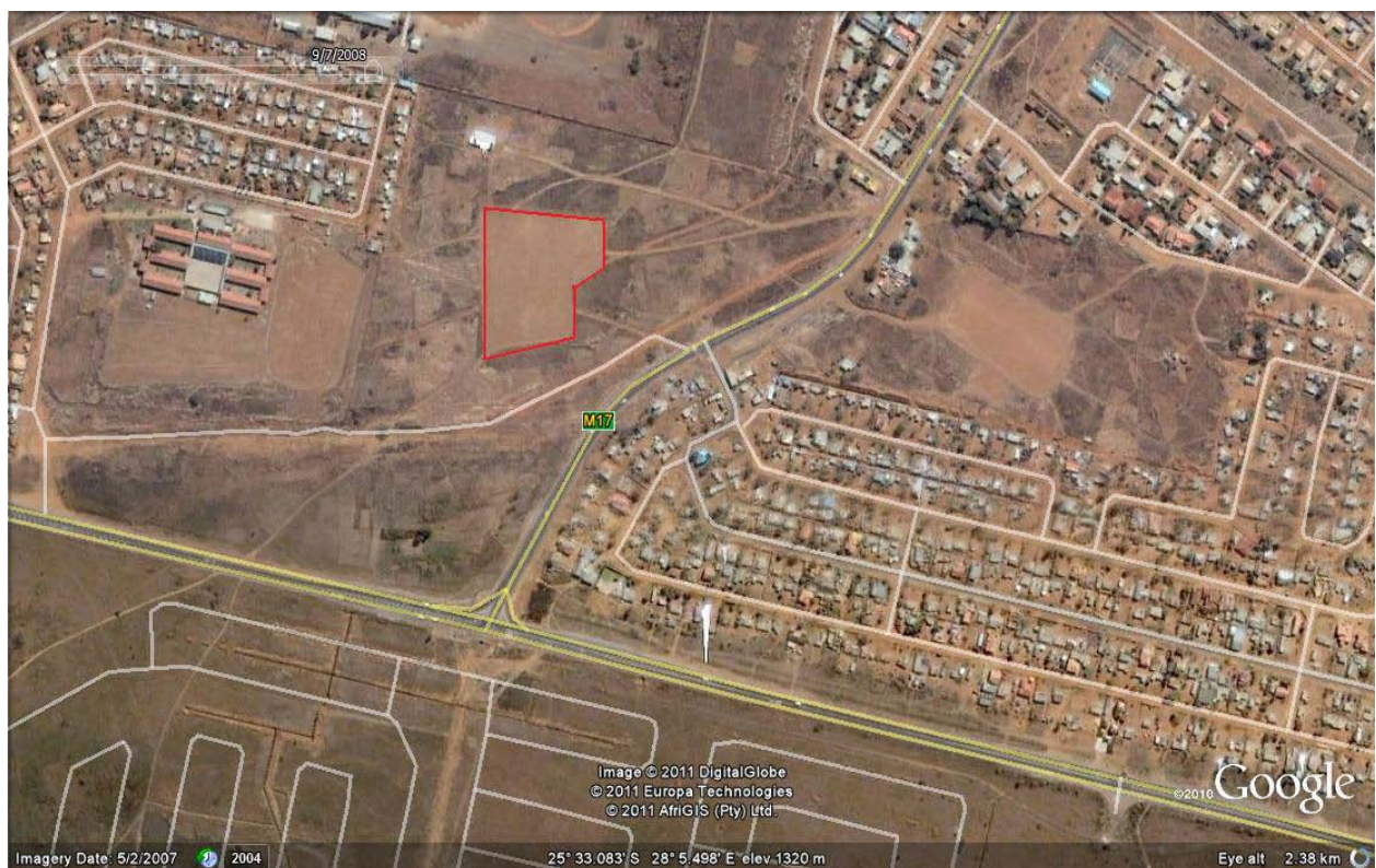
Figure 3: Aerial view of location of development.