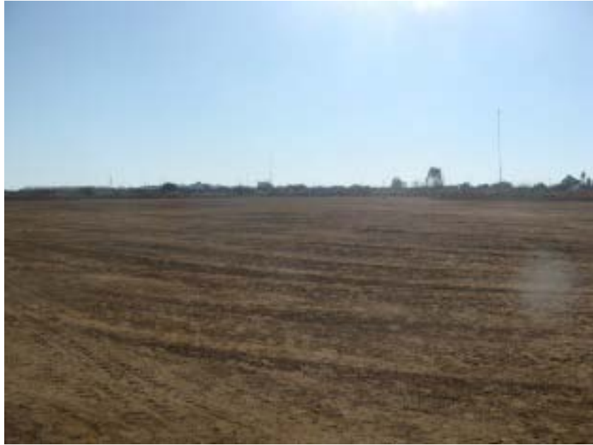
Figure 6: Soccer field in northern section.