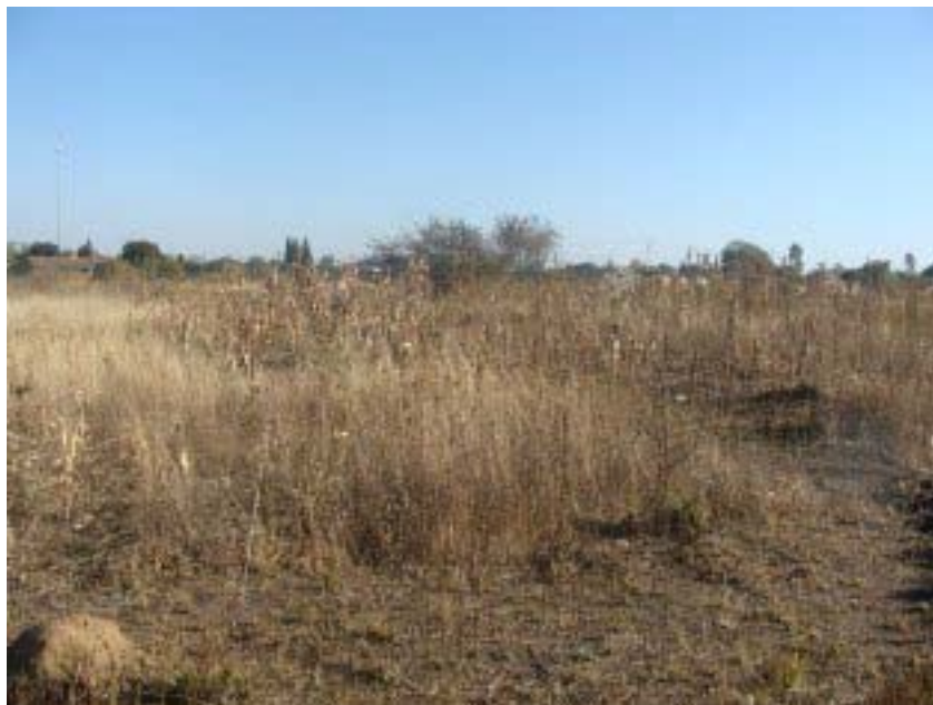
Figure 7: Another view of the area – Note the maize.