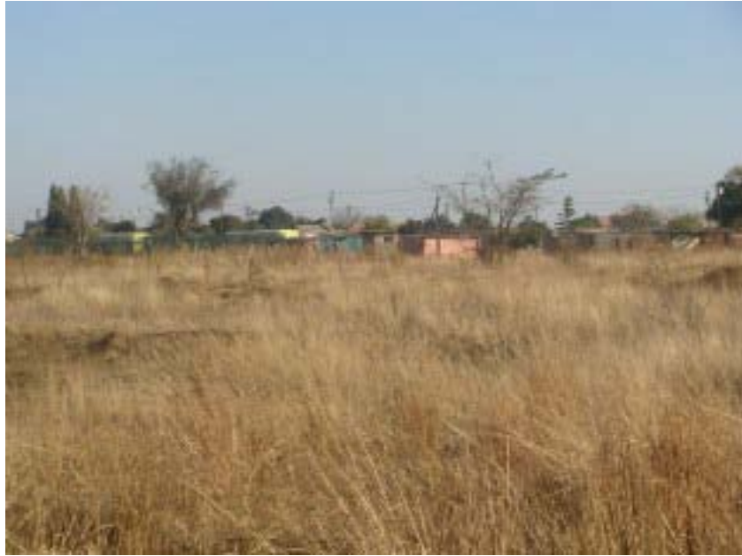
Figure 4: View of section of area. Note grass cover.