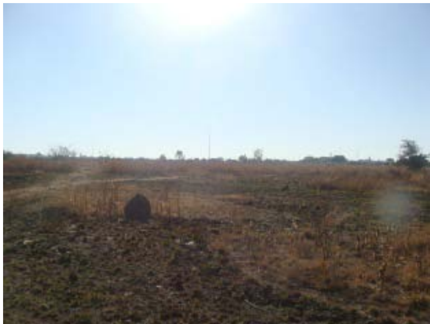
Figure 5: Another view of the area. Note the open, flat topography.