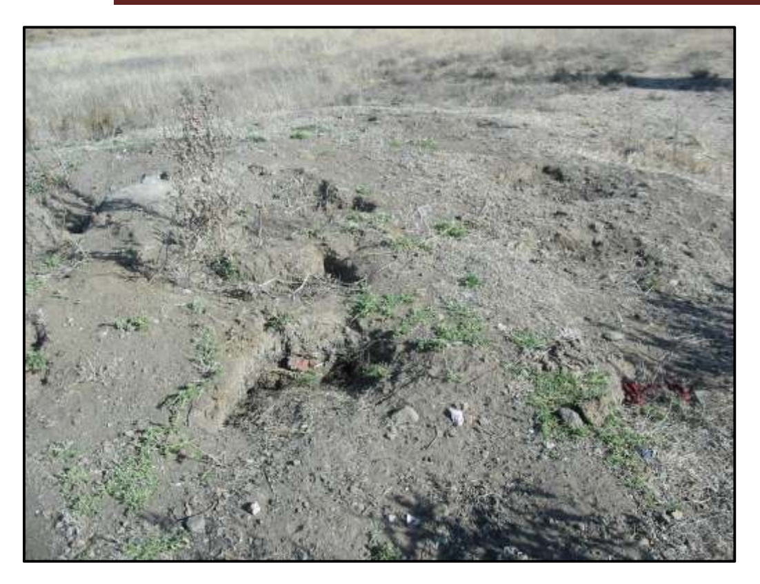
Figure 5: Midden with modern artefacts