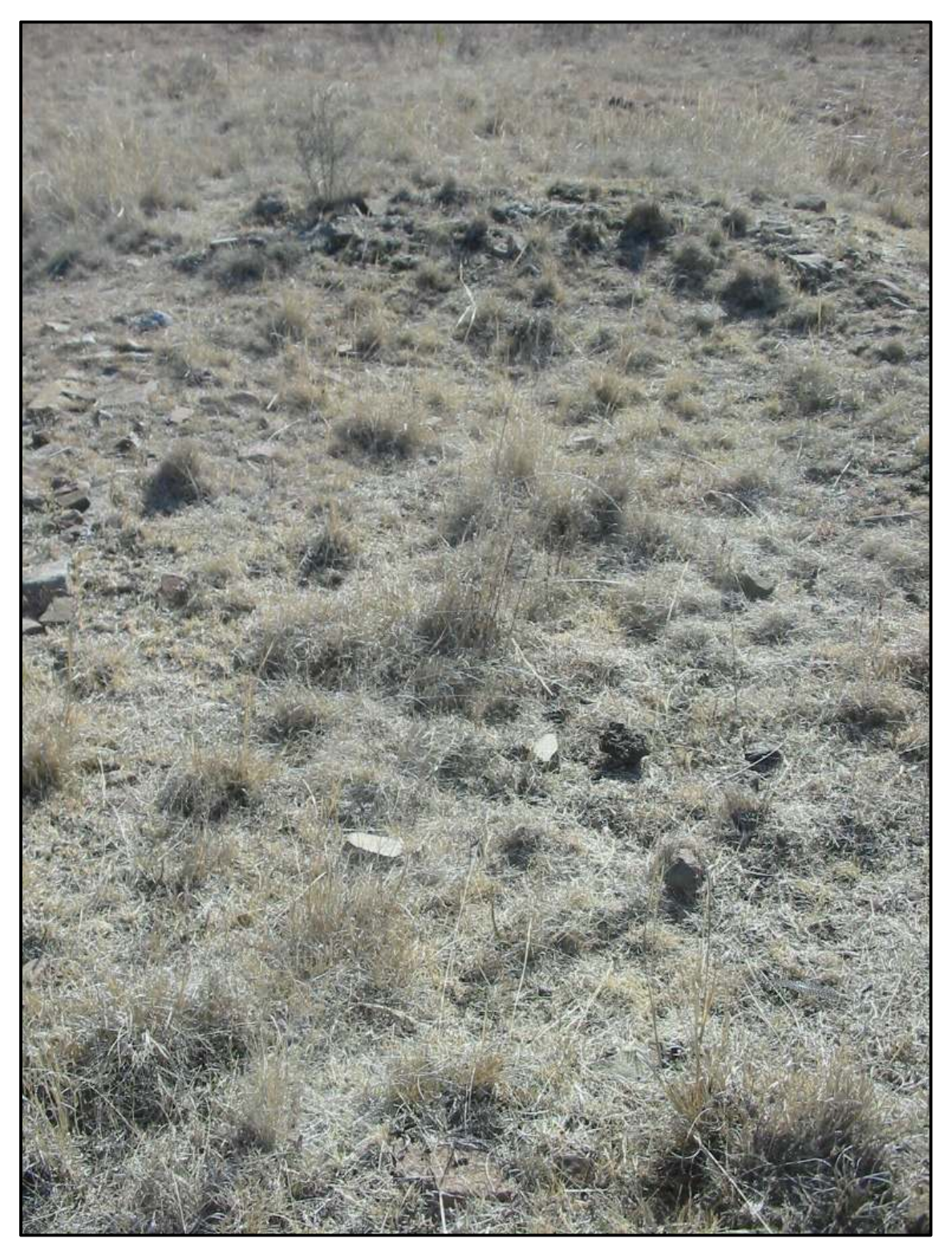
Figure 3: III defined stone wall foundations