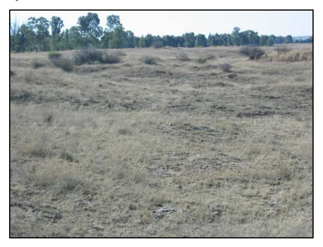
Figure 1: General site conditions

The area is extensively disturbed by ground moving activities, presumable by the quarrying for gravel for road construction. This activity would have destroyed any visible features of significance.