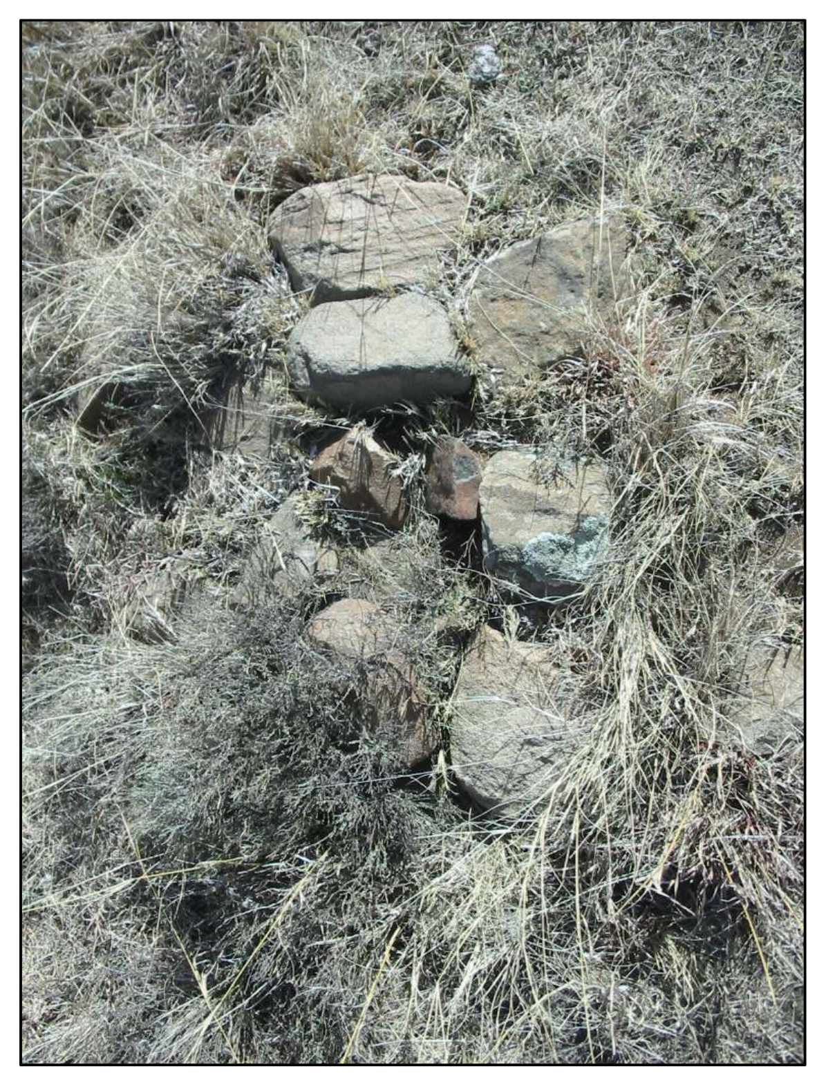
Figure 2: Possible grave dressings