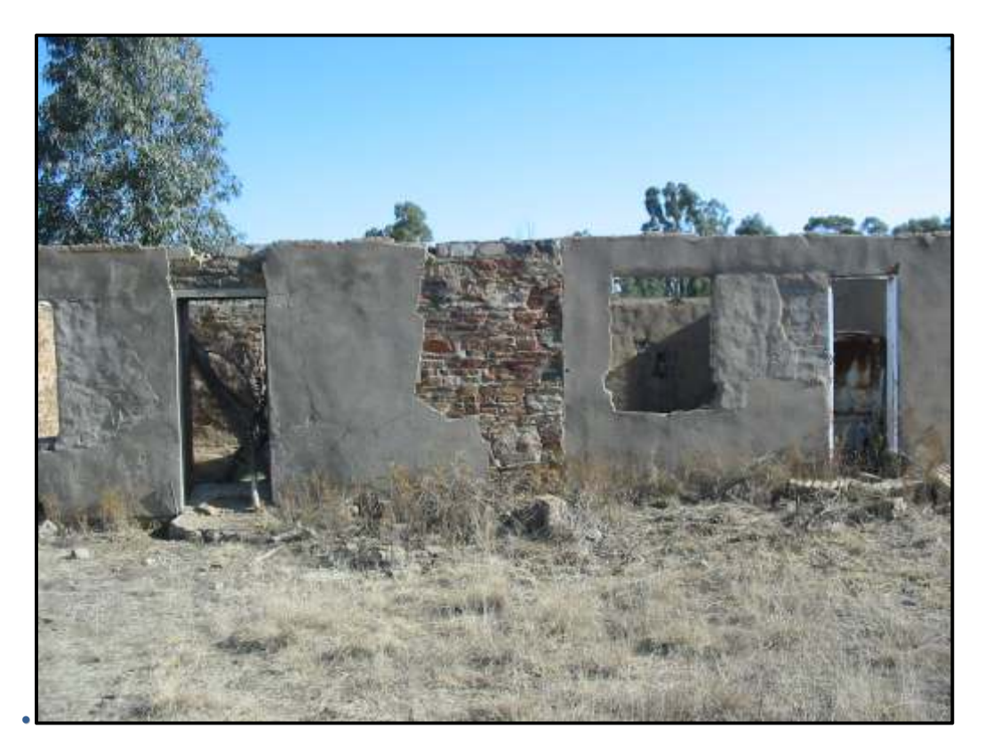
Figure 4: Rectangular structure of stone and cement