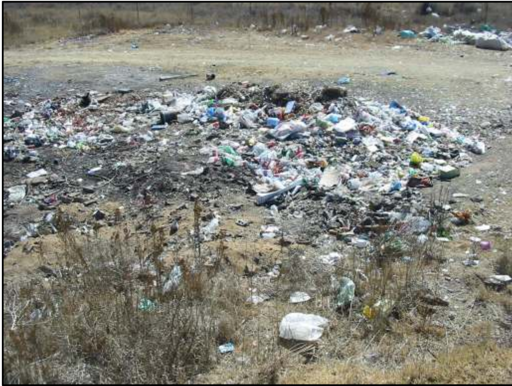
Figure 1: Illegal refuse dumping in the study area

No heritage significant sites are located within the study area. The study area is used for illegal refuse dumping and no structures or features occur within the study area. The site is located directly next to the Baddrift Bridge.