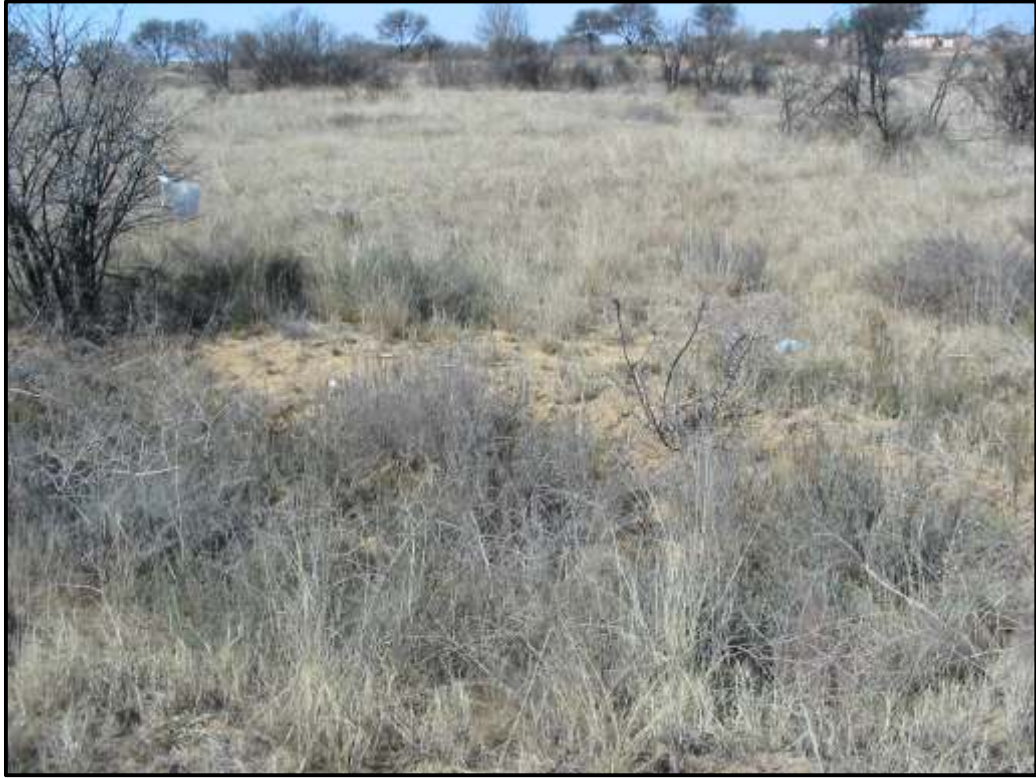
Figure 2: General site conditions