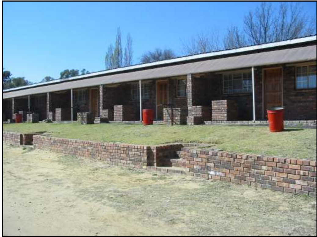
Figure 2: Chalets at Erina Spa