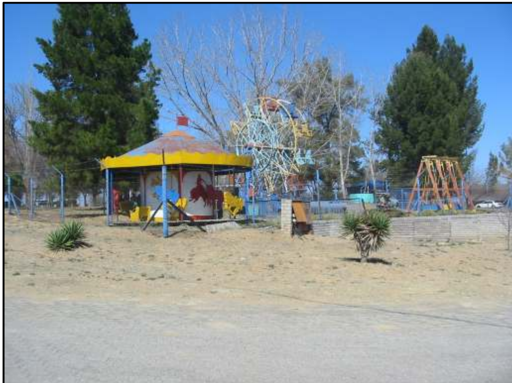
Figure 3: Joy rides at Erina Spa