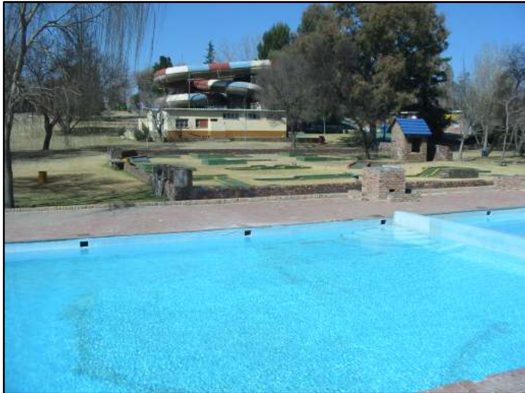
Figure 1: Swimming pool and super tube at Erina Spa

No heritage significant sites are located within the study area. The study area is currently used as holiday resort (Erina Spa) and the area is characterized by infrastructure associated with such activities. Structures like chalets, super tube, swimming pool etc would have destroyed any visible signs of heritage resources.