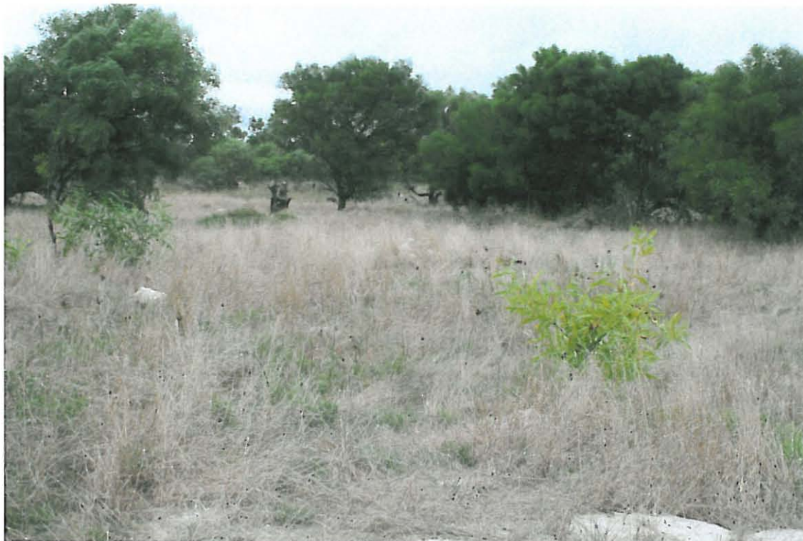
Figure 3: Ground cover