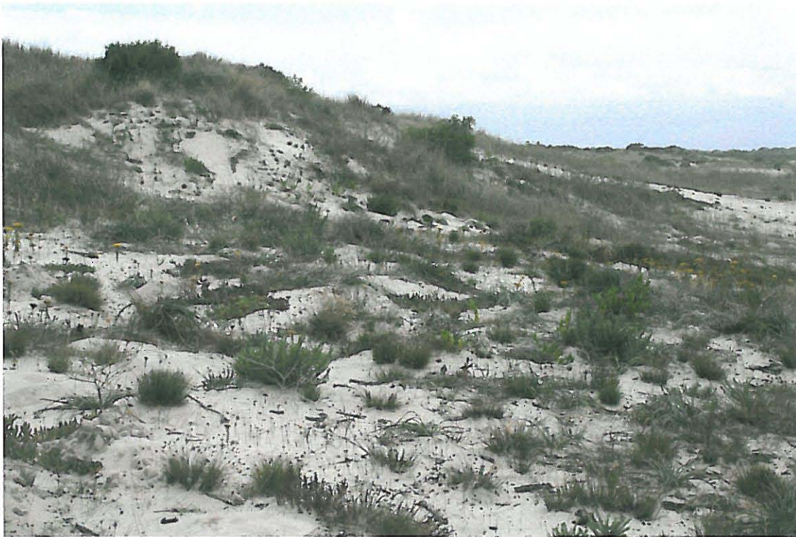
Figure 5: Ground Cover