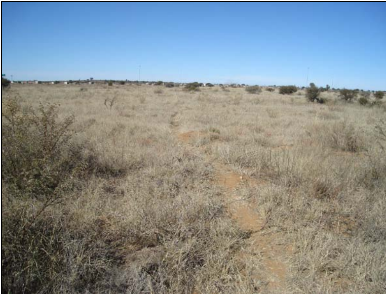
Fig.2 Point A facing towards the informal housing settlement west of Stella.