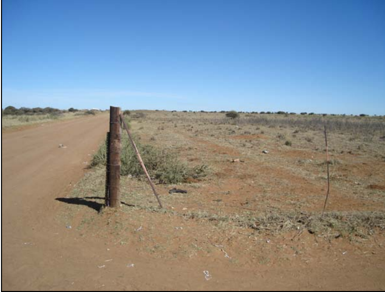
Fig.8 Point C facing south.