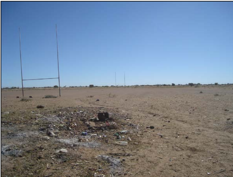
Fig.9 Sports facilities west of the informal township.