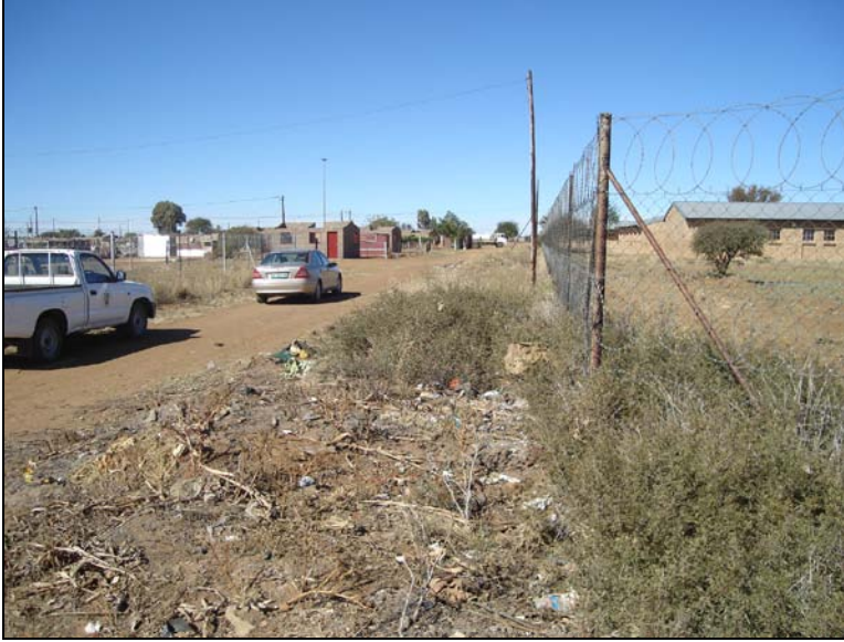
Fig.6 Point B facing east along the school fence.