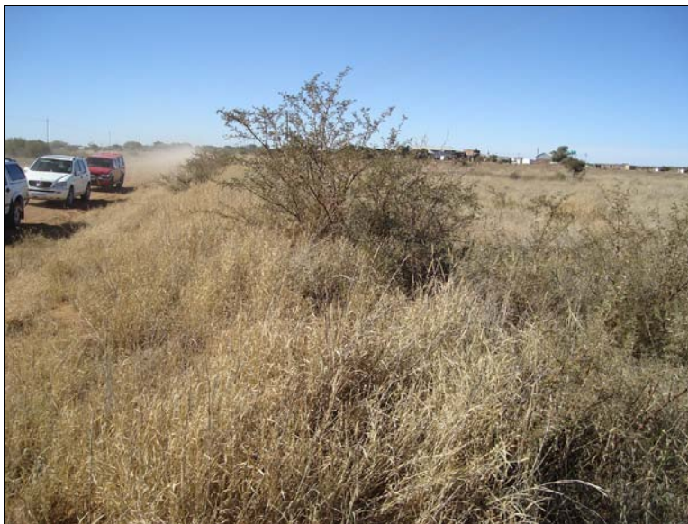
Fig.1 View from Point A along the road towards the town of Stella facing north.