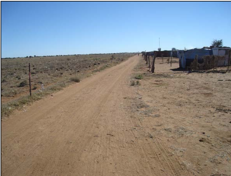
Fig.7 Point C facing west.