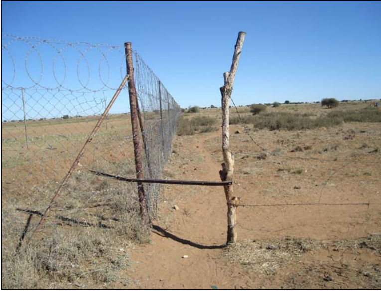
Fig.4 Point B facing south along the school fence.