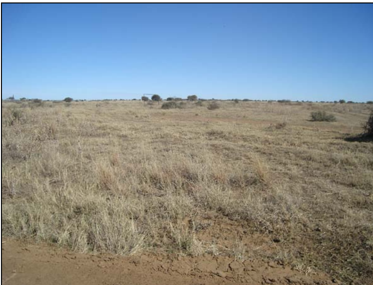
Fig.3 View from Point A facing east.