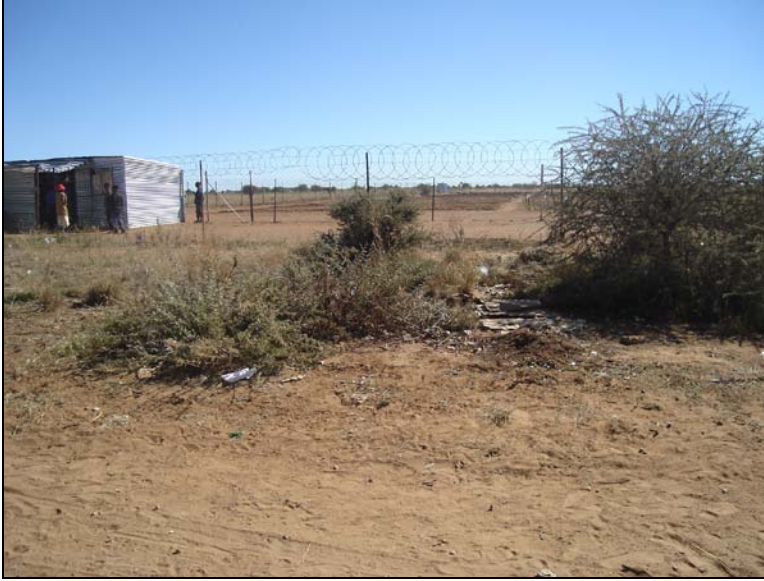
Fig.10 Part of the informal residential settlement at Stella.