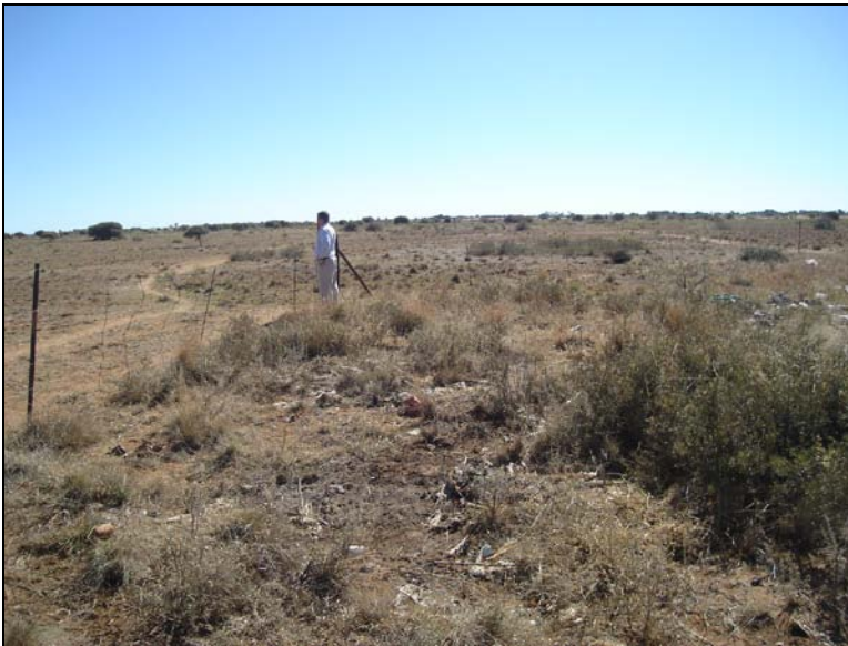
Fig.5 Point B facing west.