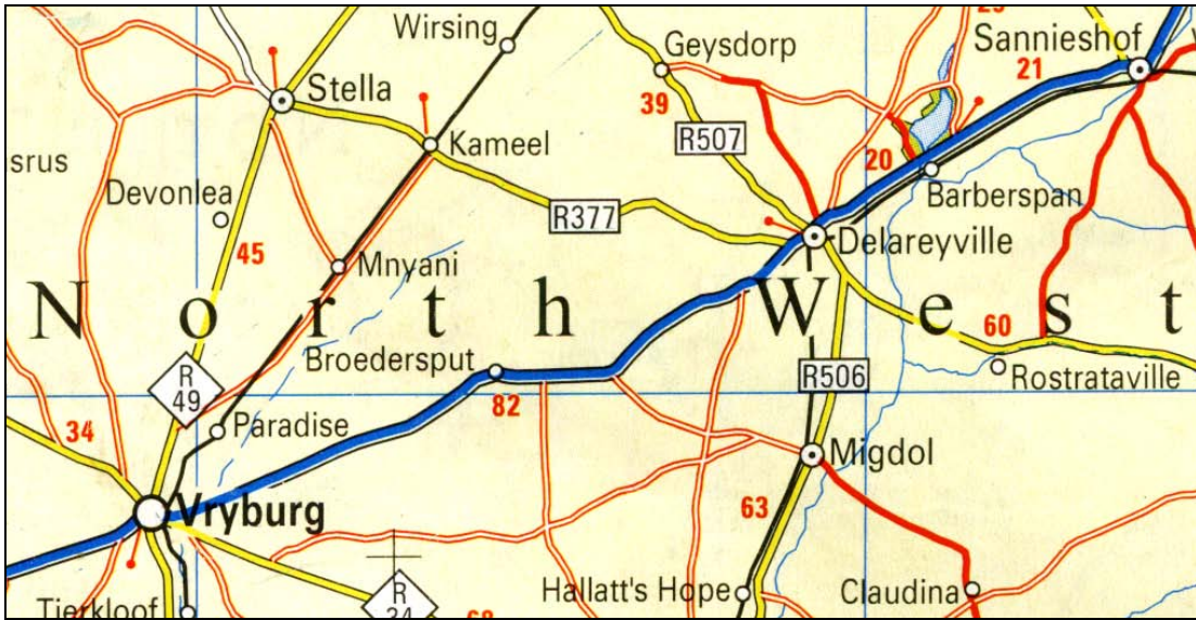
Map 1 Locality of Stella in relation to Vryburg and Delareyville along the N14, North West Province.