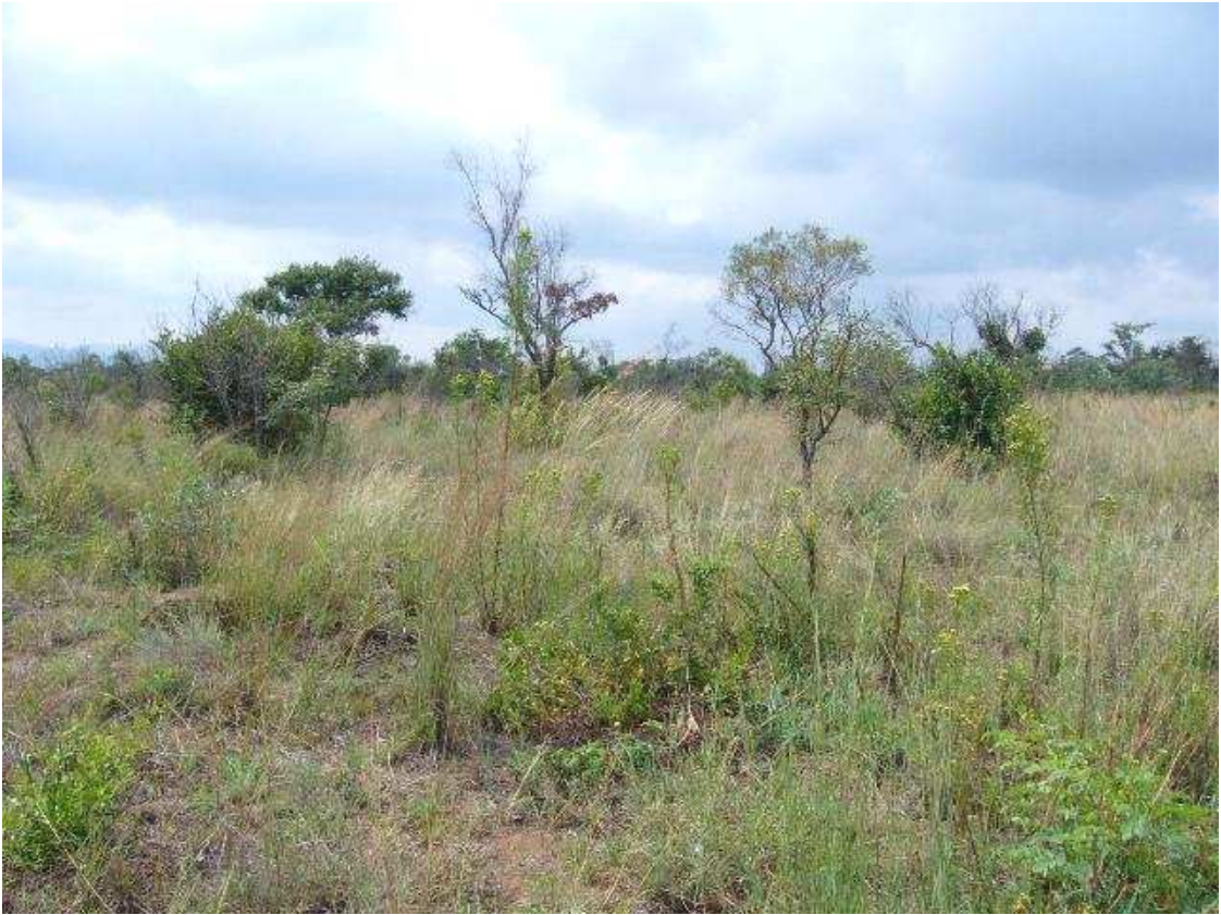
Fig 1. General view of the area.