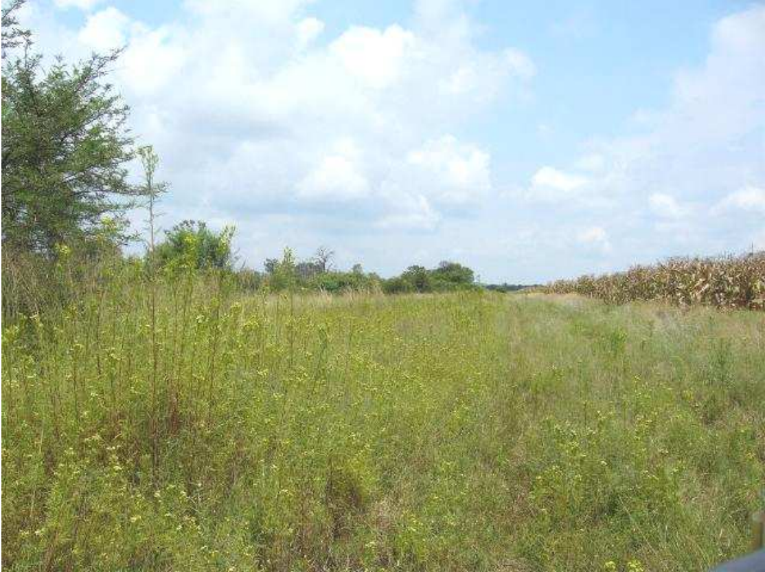
Fig 1. General view of the area. Note maize field to the right.