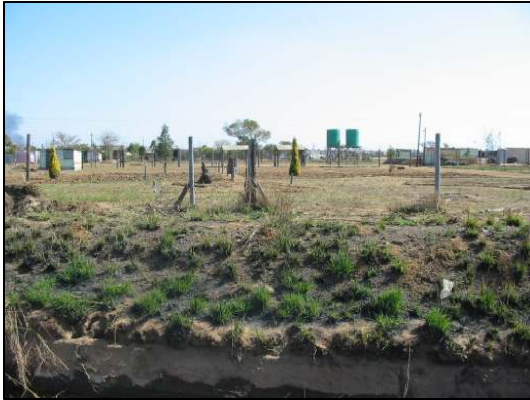
Figure 1: General Site Conditions

No heritage significant sites could be located within the study area. Ground visibility is medium since the area is currently used for agricultural purposes. The proposed school is located at Coordinates S 25°22'02.91105" E 28°18'45.378110" .