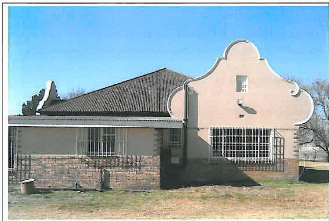
Figure 11- HH07 has been renovated and fitted with new Cape-styled gables (above).

This renovated residence on Hartbeestfontein 522 is older than sixty years and therefore qualifies as a historical structure. However, it has been restored, extended and fitted with new Cape-styled gables.