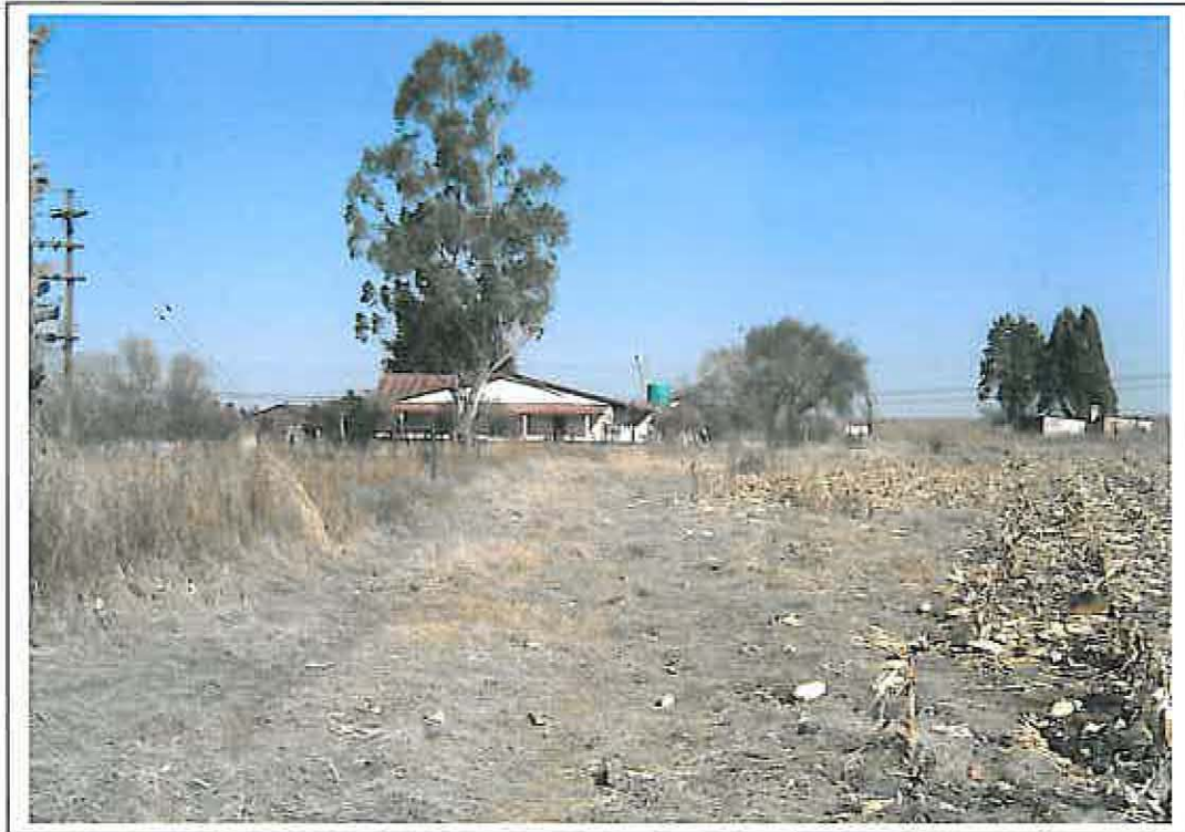
Figure 9- The main residence (FC05.1) in Farmstead Complex 05 is associated with several outbuildings and a graveyard (above).