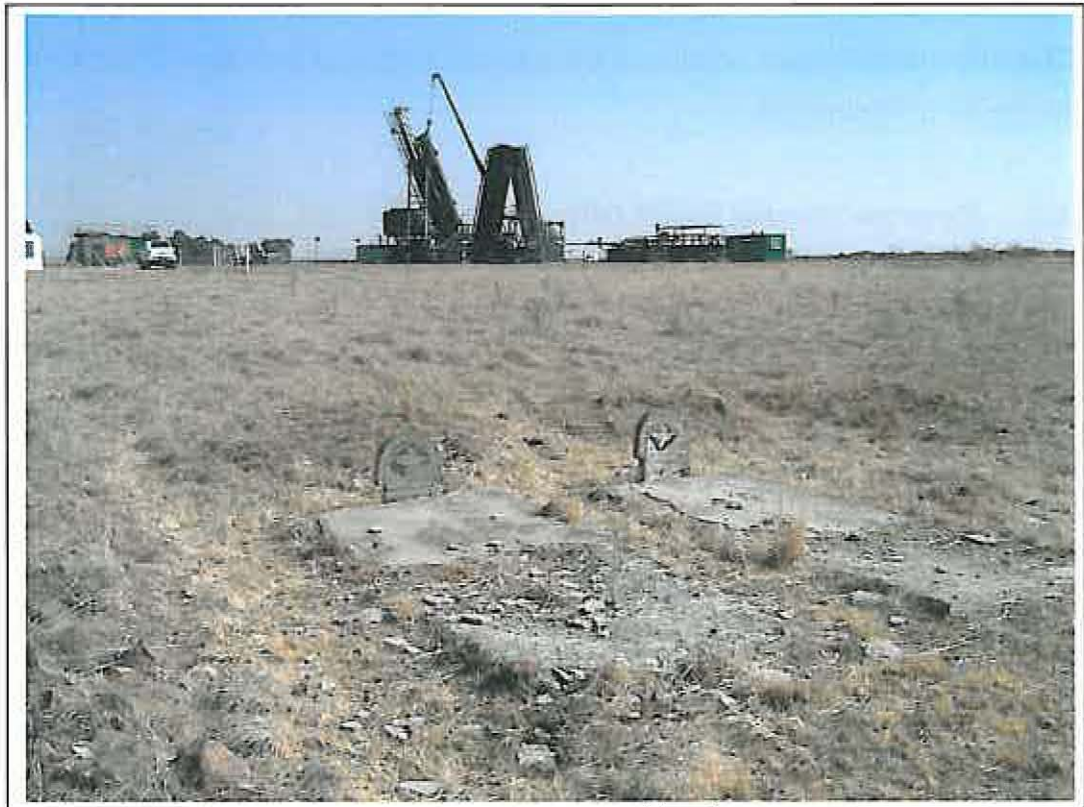
Figure 19- GY22 holds the remains of at least five individuals close to Sasol's proposed new shaft complex on Strybult 542 (above).