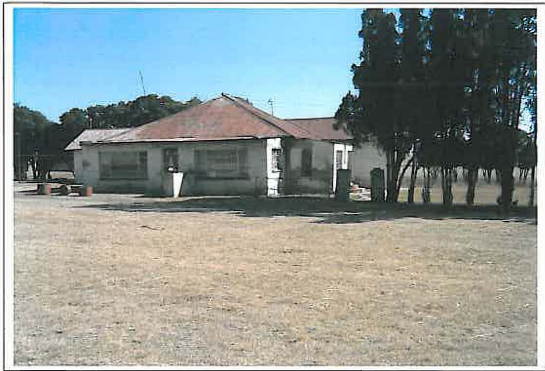
Figure 10- HH03 on Holgatsfontein 535 (above).