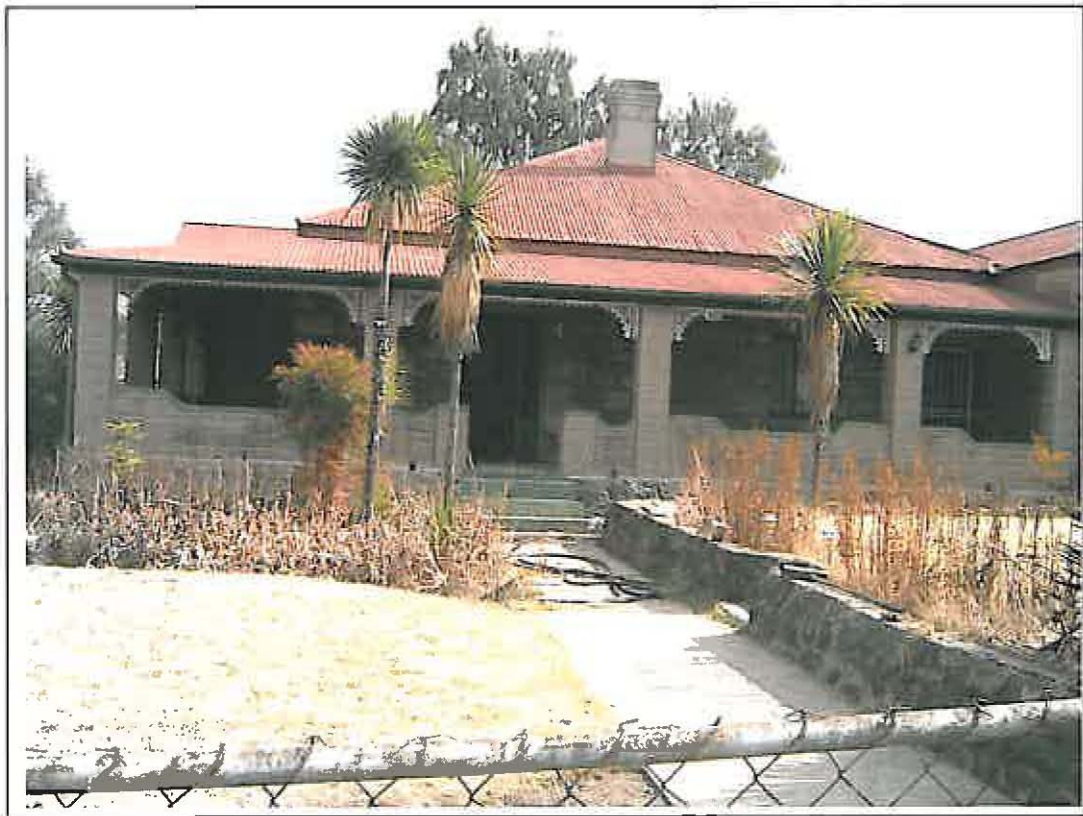
Figure 6- The main residence (FC02.1) constructed with sandstone which is part of FC02. It is associated with a wagon shed (FC02.2) which reveals the same architecture features and building material (above).