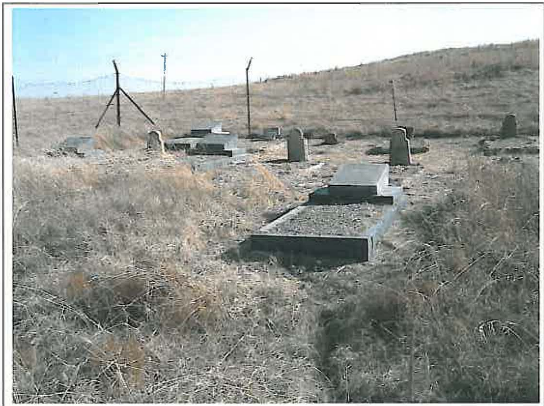
Figure 18- GY15 on the northern shoulder of the Grootvlei road holds the remains of at least twenty former farm labourers (above).

GY16 is located on Weltevreden 535 next to a school premises.