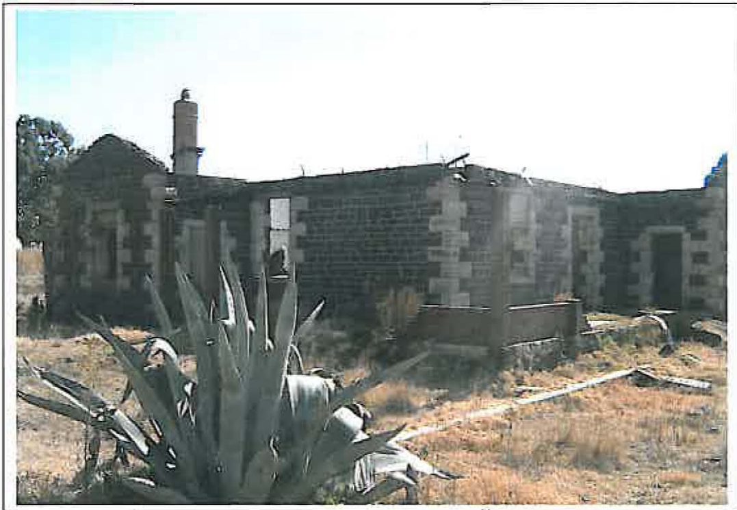
Figure 13 - HH12 was constructed with dolerite and sandstone corner posts and door and window frames (above). This structure is associated with a wagon shed which was constructed with dolerite stone.

HH12 on Carmona 536 along the Hartebeeskuil road consists of a residence which was constructed with dolerite walls and sandstone corner posts. It is associated with a wagon shed which was built with dolerite stone. The latter structure is covered with a pitched iron corrugated roof.