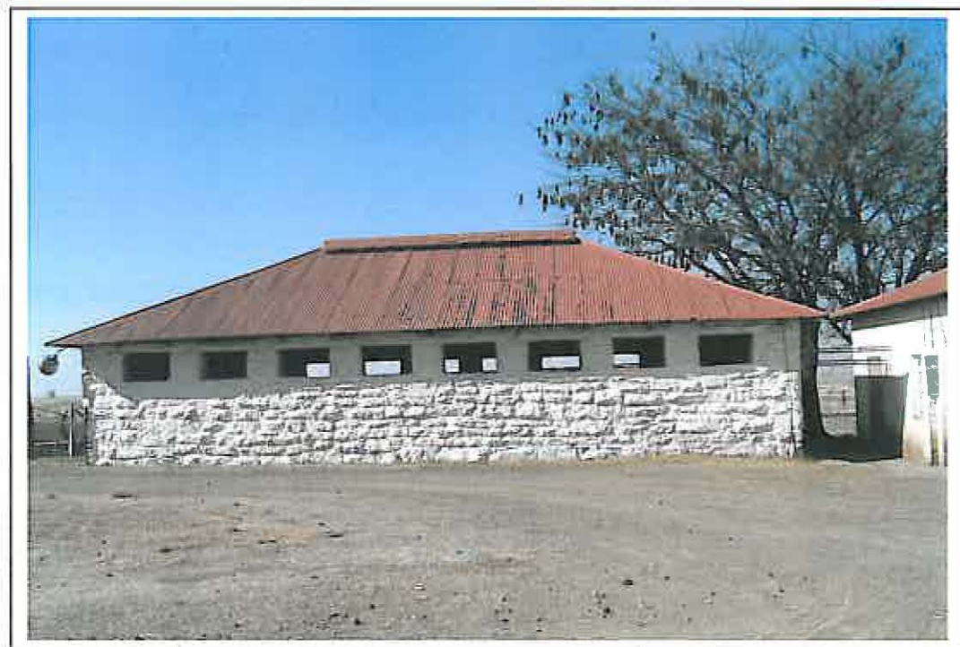
Figure 12- A dairy with historical significance on Weltevreden 565 (above).

This residence on Weltevreden 565 probably dates from the 1940's. It is associated with a dairy with historical significance.