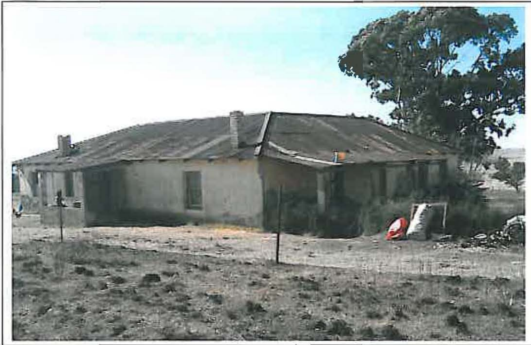
Figures 7 & 8- A farm house in farmstead complex FC04 (above) which also incorporates other residences and outbuildings, some of which are constructed with sandstone (below).