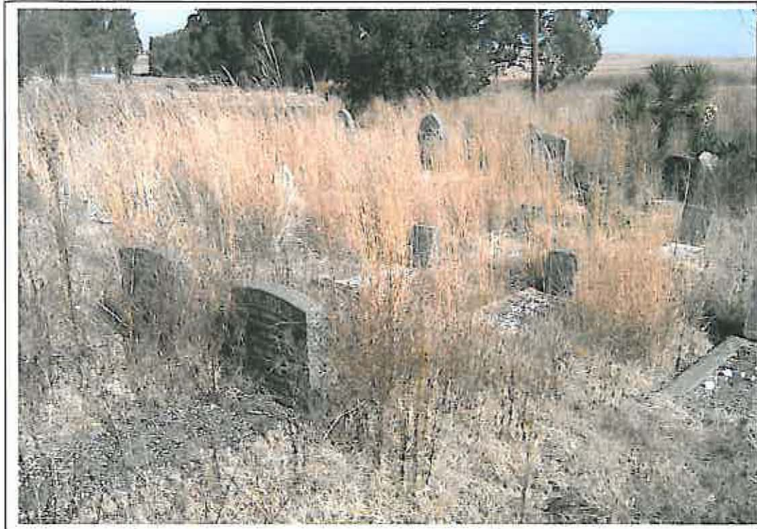
Figure 16- Historical GY08 near the Wildeals turn-off contains the remains of the Ras, Nel and Viljoen families (above).