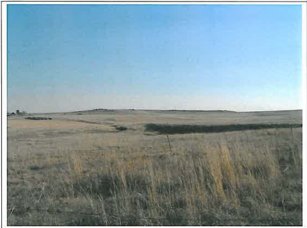
Figure 2- Sasol's proposed new Shaft Complex with an underground mine will be located on the farm Strybult 542, more or less in the middle of the North Block. This area is characterised by outstretched grass veldt and agricultural fields. The proposed new shaft will be located some distance from the foot of Platkop, the slight rise in the background (above).

The archaeological and historical significance of this cultural landscape therefore must be described and explained in more detail before the results of the Phase I HIA study is discussed (see below, Part 5).