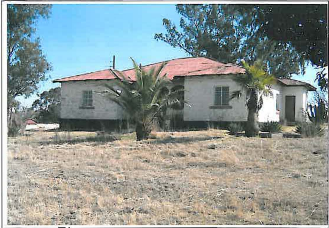
Figures 4 & 5- Main residence (FC02.1) and wagon shed (FC02.2) in Farmstead Complex 02 on Holgatsfontein 535 (above).