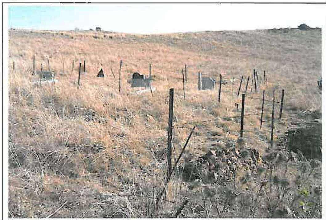
Figure 15- GY06 is located along the lower foot slope of a randje on Holgatfontein 535 (above).