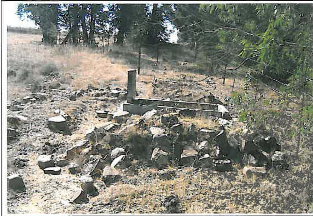
Figure 14- GY02 on the edge of a Blue Gum lot holds at least twenty graves, the majority of which are covered with piles of stone (above).