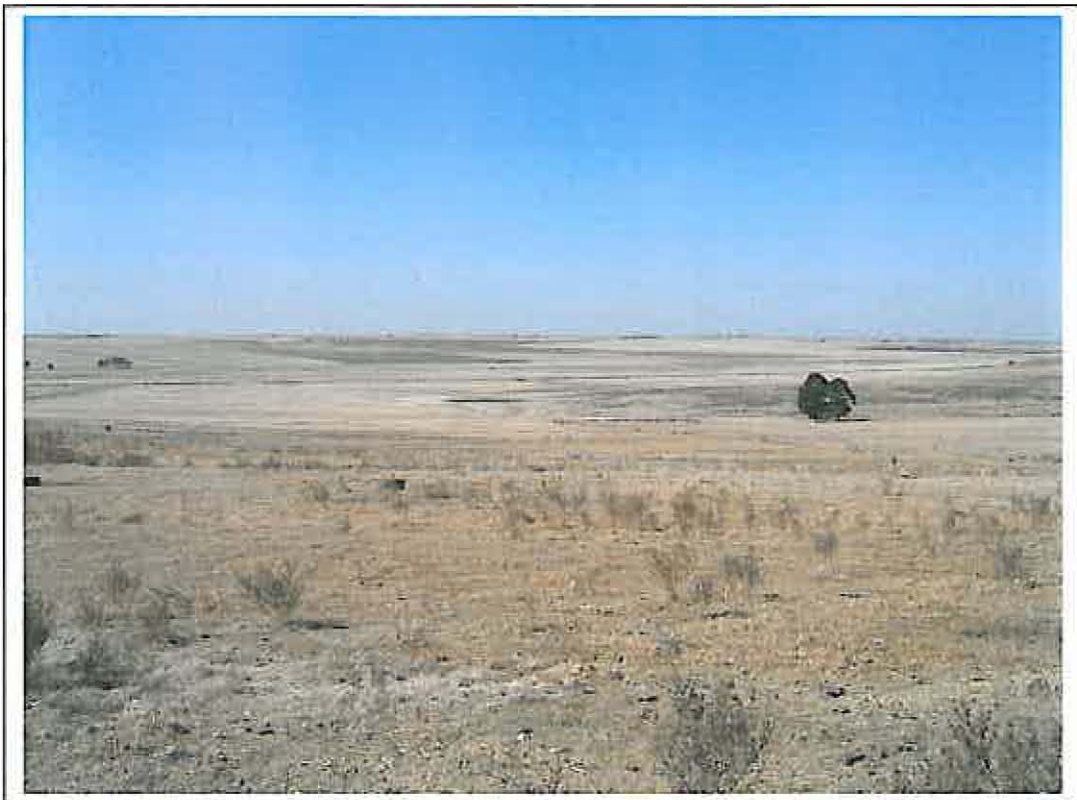
Figure 1- Sasol's North Block on the Eastern Highveld of the Mpumalanga Province is an undulating piece of land which is characterised by outstretched grass veldt and agricultural fields. This piece of land is dotted with farmstead complexes which are usually associated with Blue Gum avenues or with smaller plantations of these trees (above).

The Sasol Project Area is located in the midst of a cultural landscape that is marked by heritage remains dating from the pre-historical into the historical (colonial) period. Stone Age sites, Iron Age sites and colonial remains therefore do occur in the Eastern Highveld (see Part 8 'Select Bibliography').