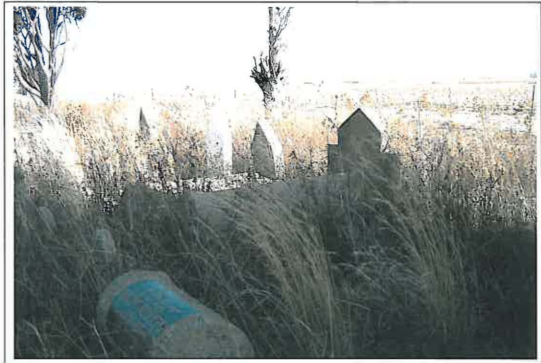
Figure 17- Historical GY12 on Weltevreden 535 holds the remains of at least 13 individuals (above).