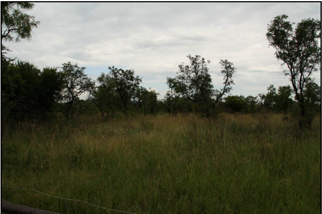
Fig. 4. Southern section of the study area.