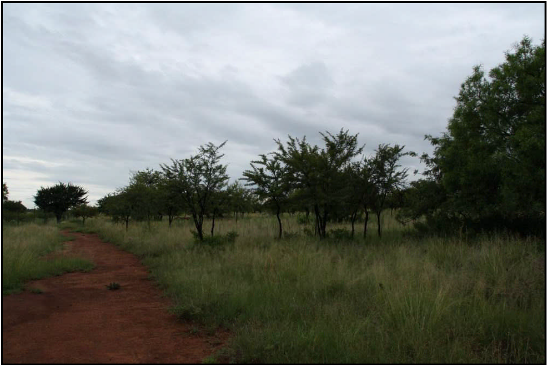
Fig. 3. Northern side of the study area.