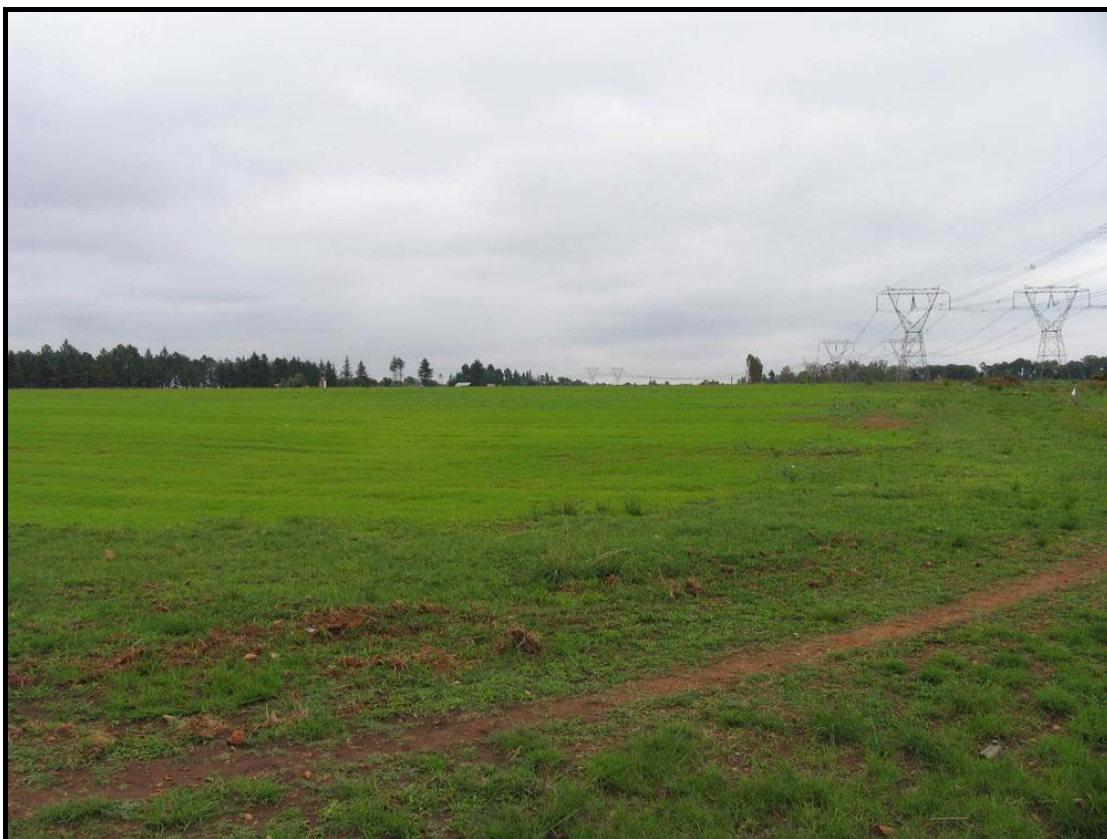
Fig. 2. A view of the site.