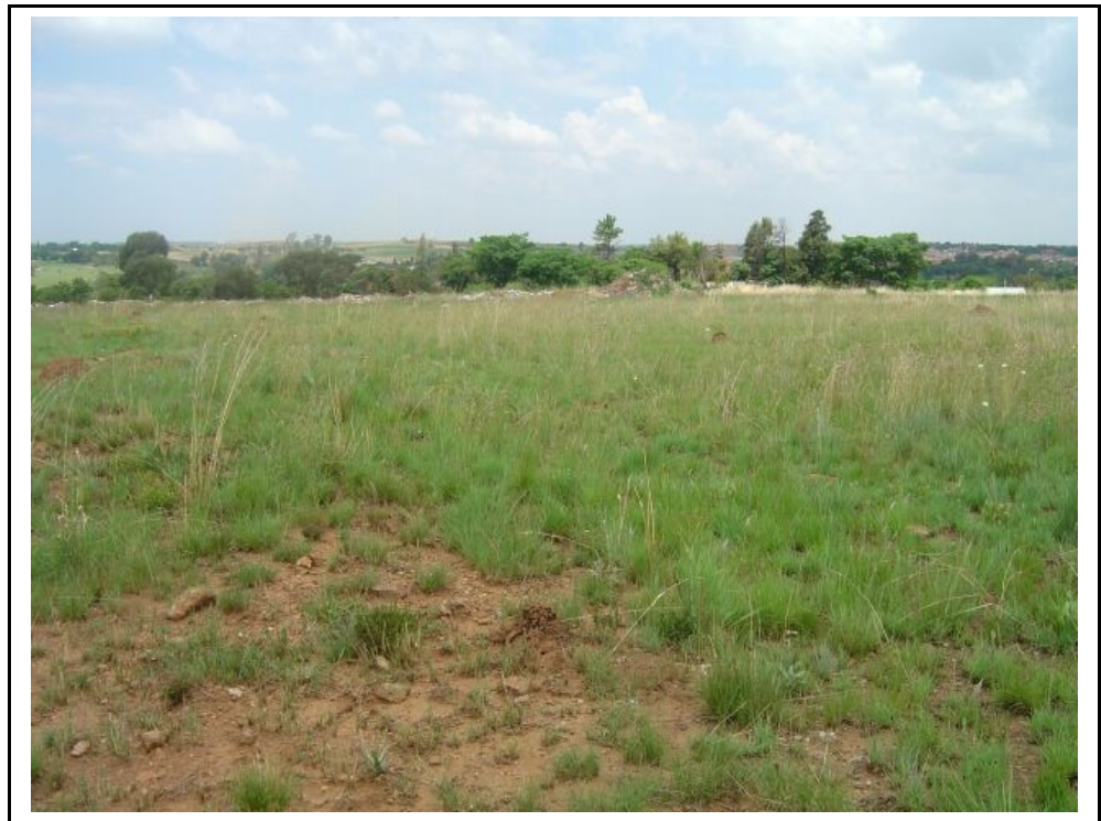
Figure 1 – Site conditions on site

Maps of 1944 and 1959 indicate no structure in the area and thus none of the current structures to be older than 60 years.