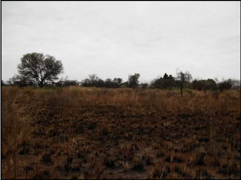
Figure 2: General view of site from south