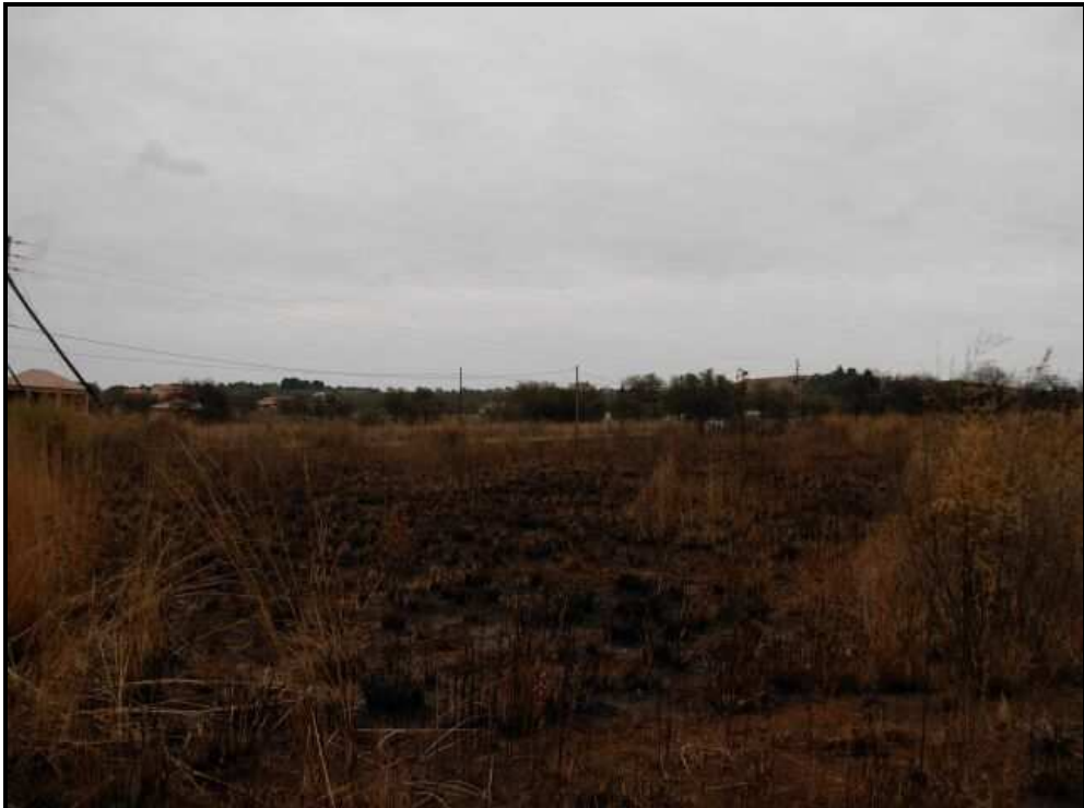
Figure 3: View toward the west