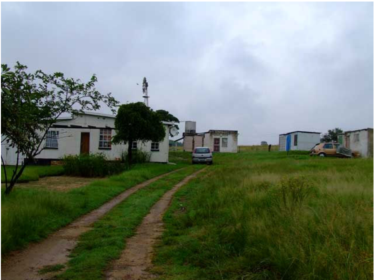
Figure 1: General view of site

(Refer to Figure 1 for general view of property.)