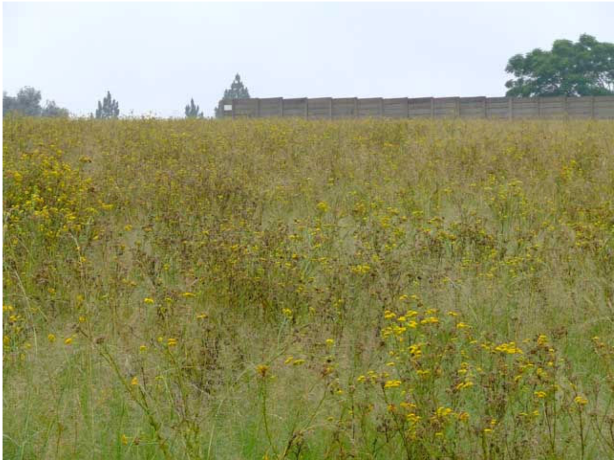
Figure 2: South-western section of site