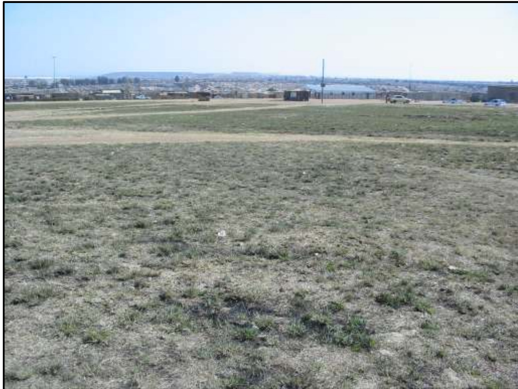
Figure 1: General Site Conditions

No heritage significant sites are located within the study area. Ground visibility is high within the study area. The proposed school is located in close proximity to the intersection of Luthuli and Madja Street, Tsakane Extension 9 on Erf 12913. Coordinates S 26°22'42.29253" E 28°22'42.41039" .