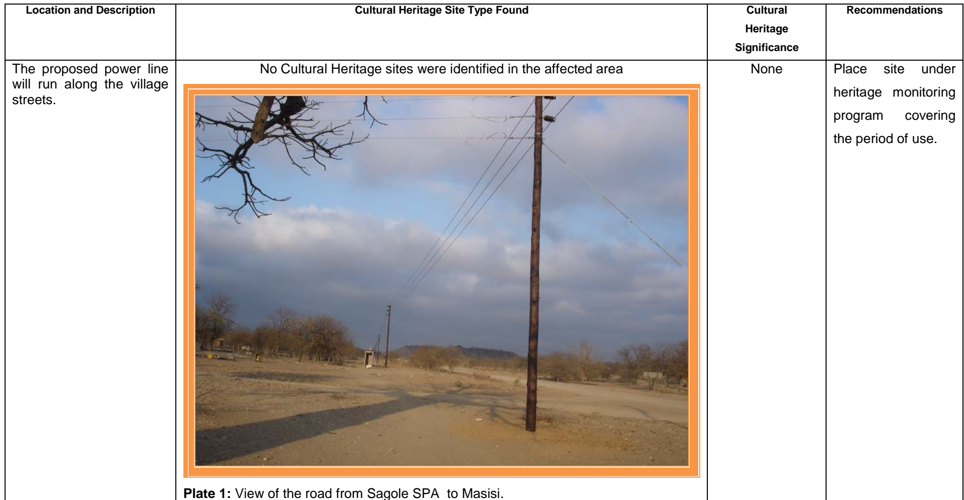
Plate 1: View of the road from Sagole SPA to Masisi.