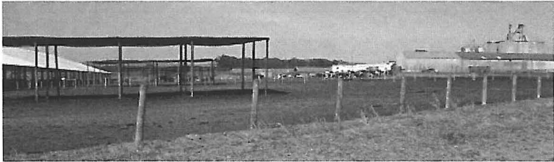
Figure 3. Existing cattle-housing structure on left that the new structure will parallel. Other facilities on the farmyard are on the right.