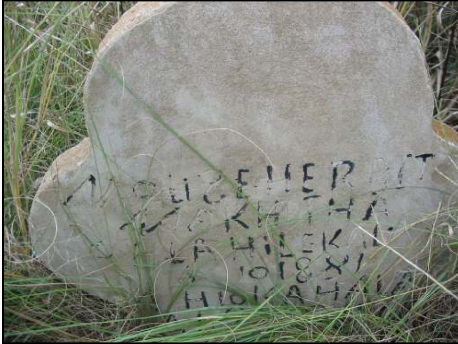
Figure 3: Headstone of stone packed grave