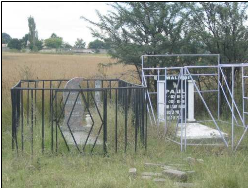
Figure 2: Graves on adjacent property