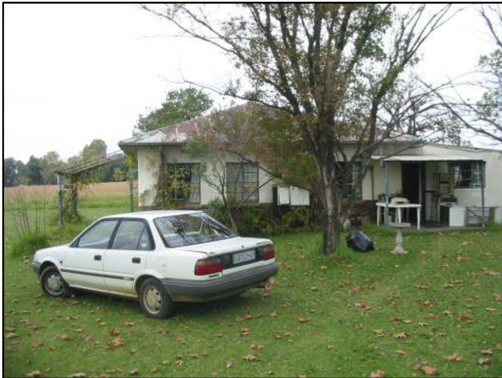
Figure 4: Residential dwelling on property