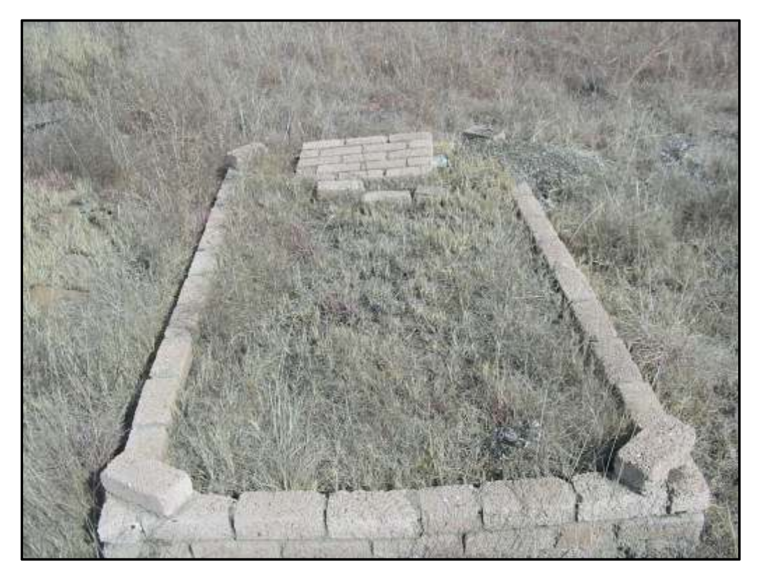
Figure 1: Grave dressings