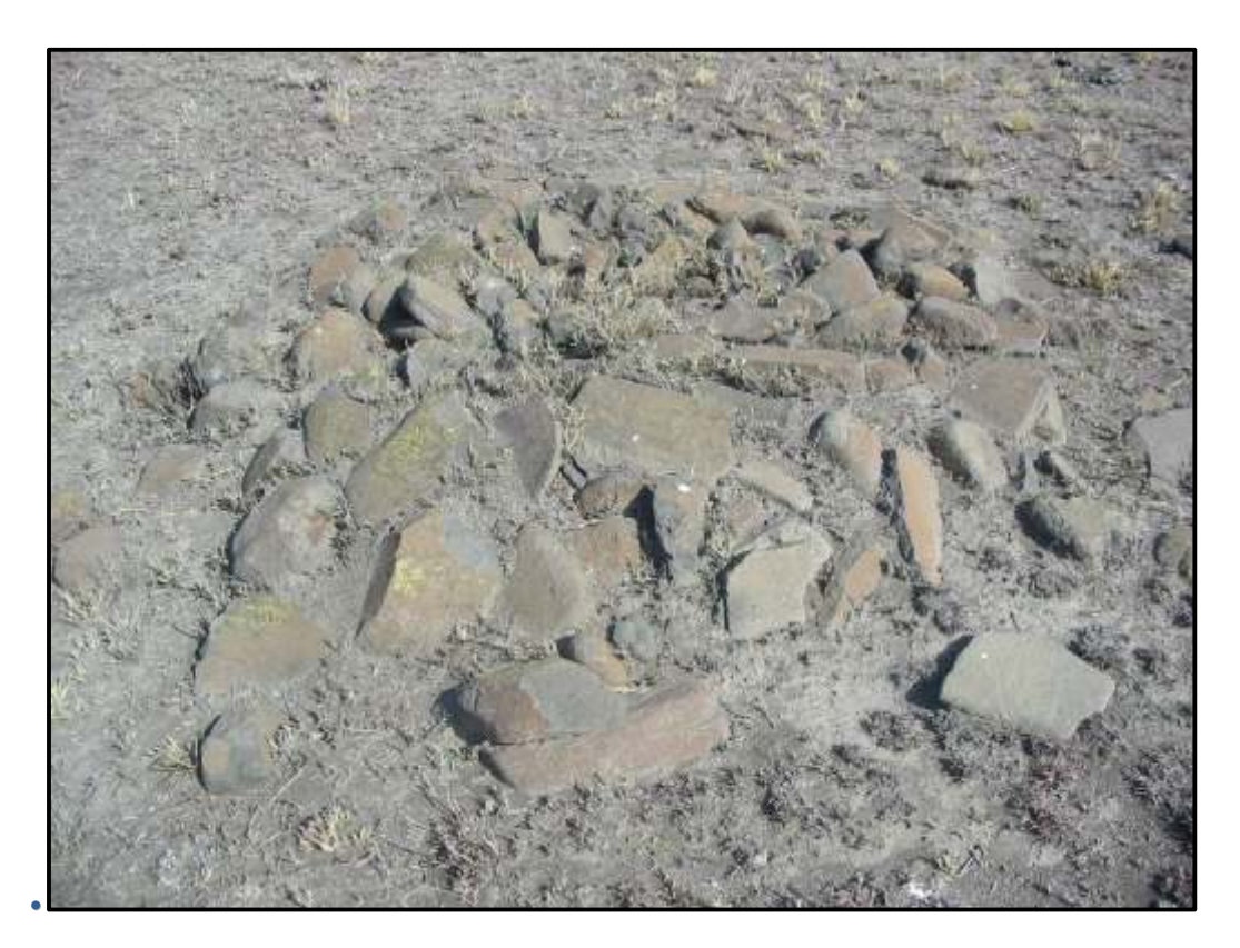
Figure 2: Stone grave dressing