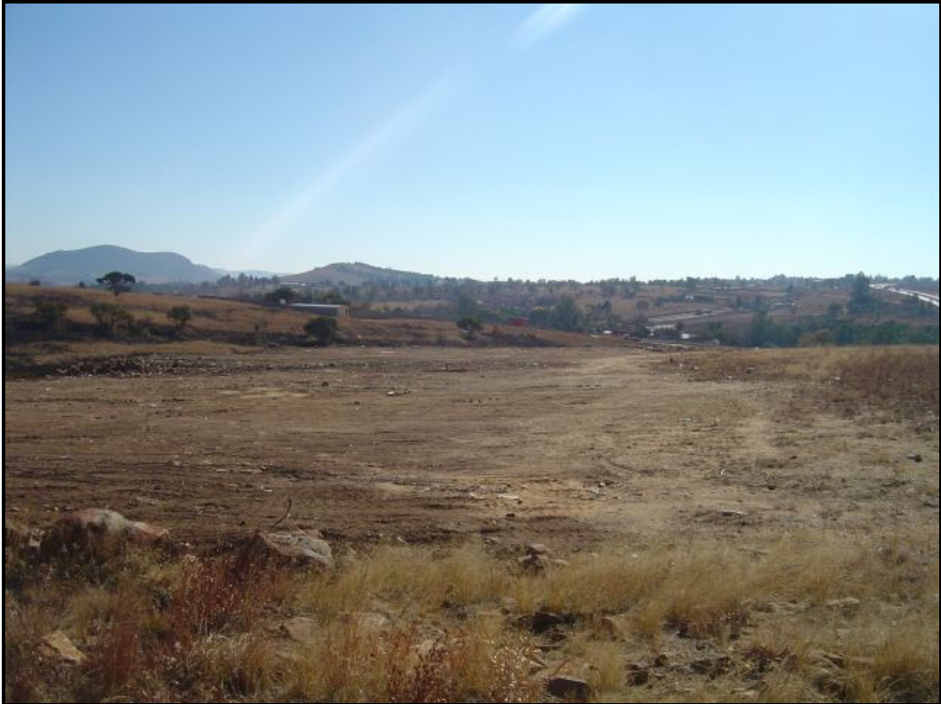
•Figure 3: Disturbed area