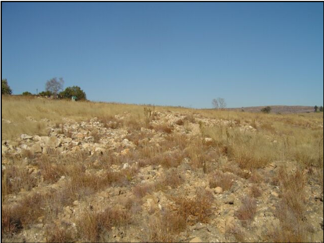
•Figure 4: Ripped area