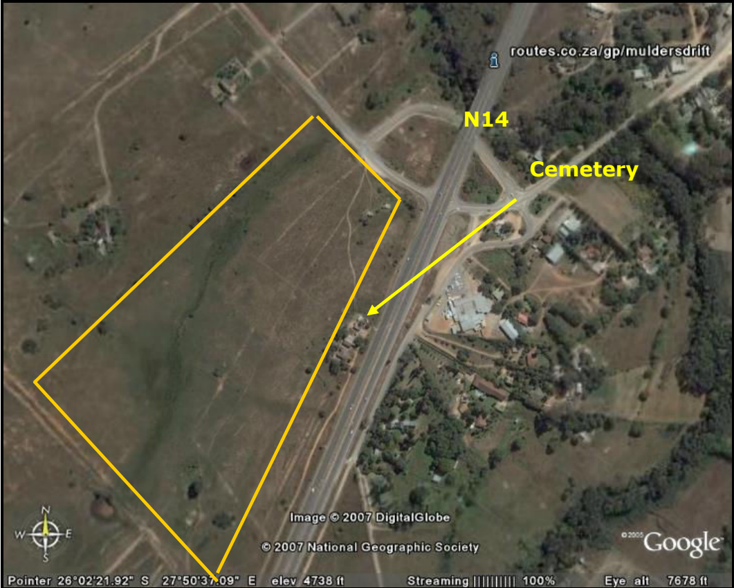
•Figure 1: Locality of site