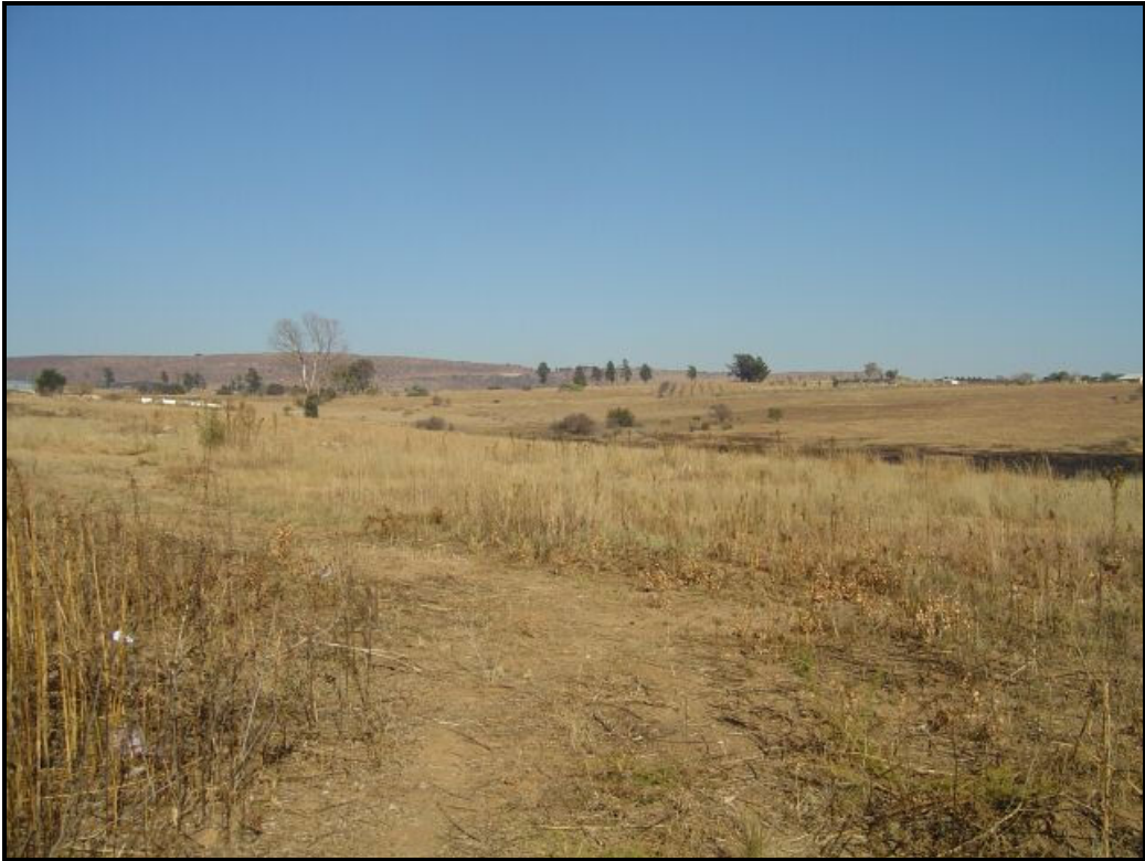
•Figure 2: General Photo of site