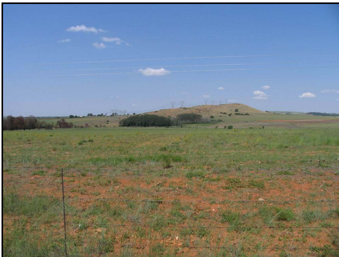
Fig. 3. Study area A.