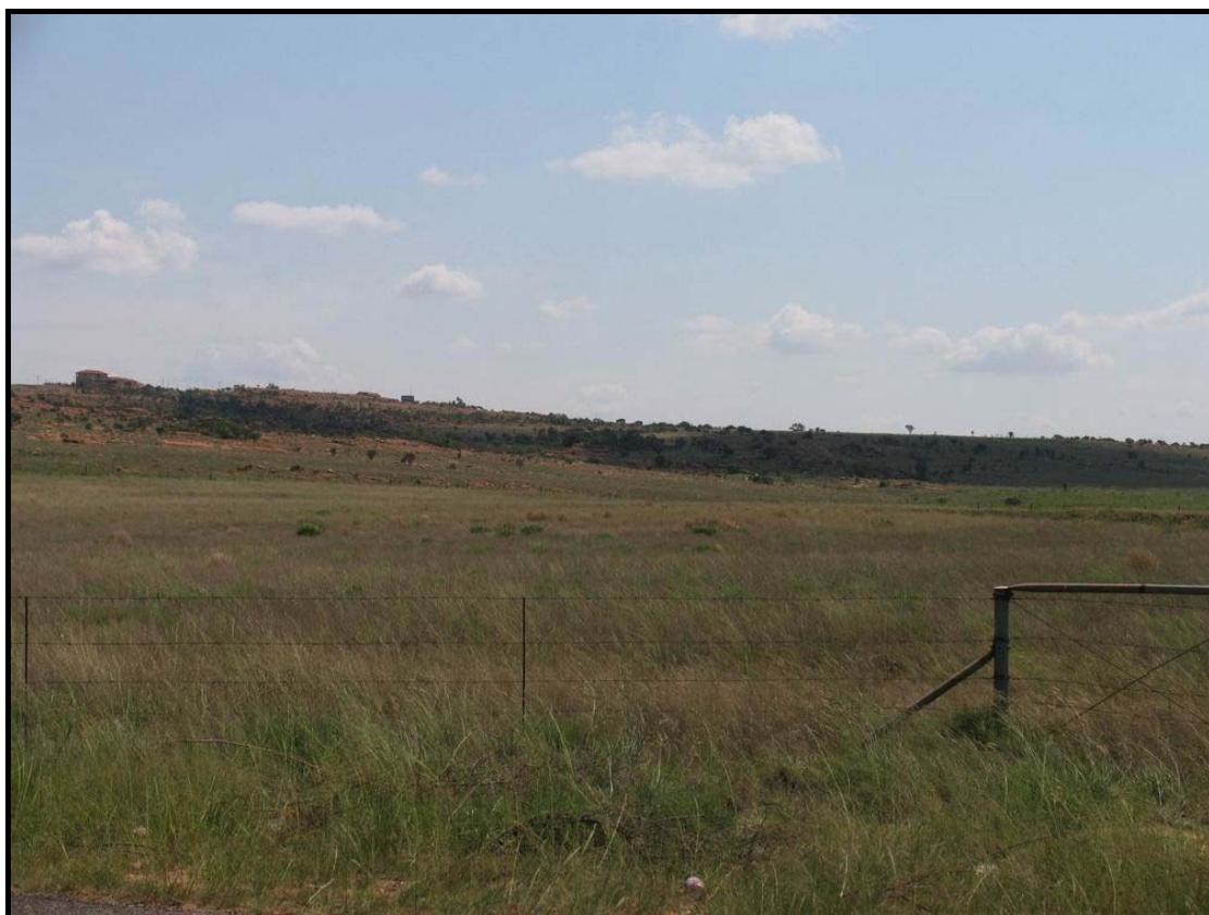
Fig. 4. Study area B.