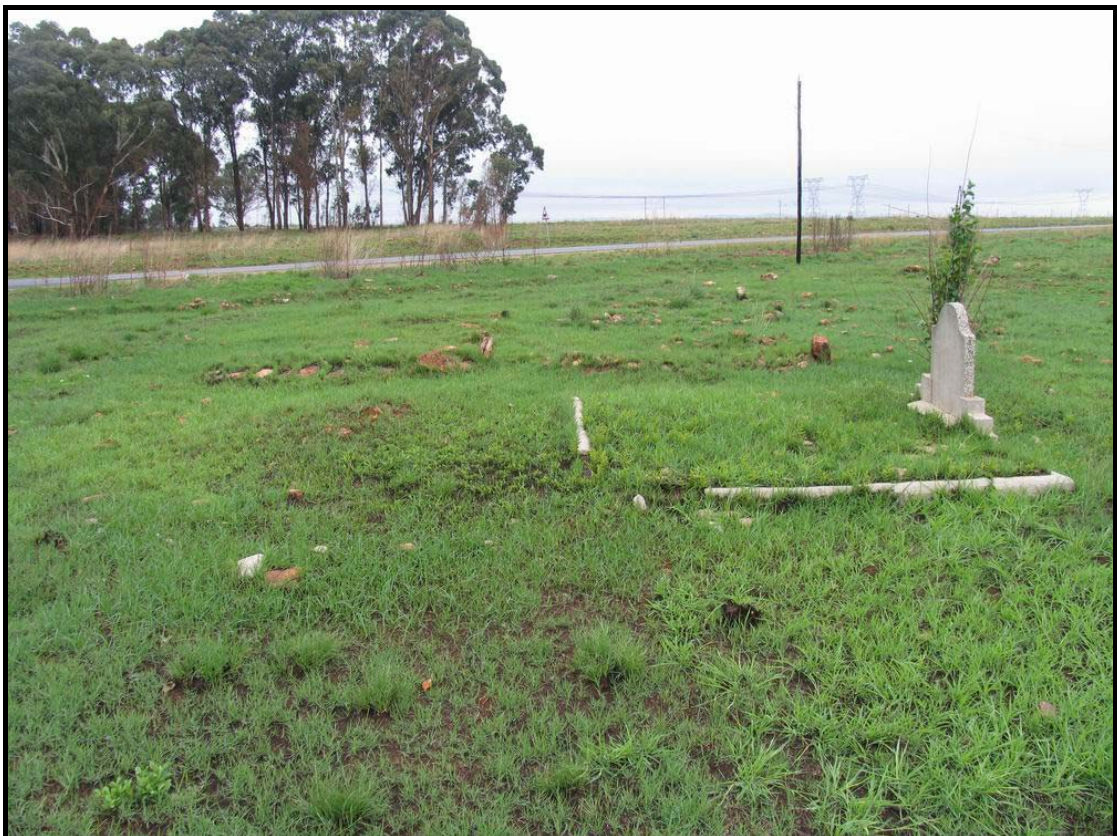
Fig. 2. Showing the area with some of the graves.

Legal requirements : SAHRA and other permits, consultation, notification, etc.