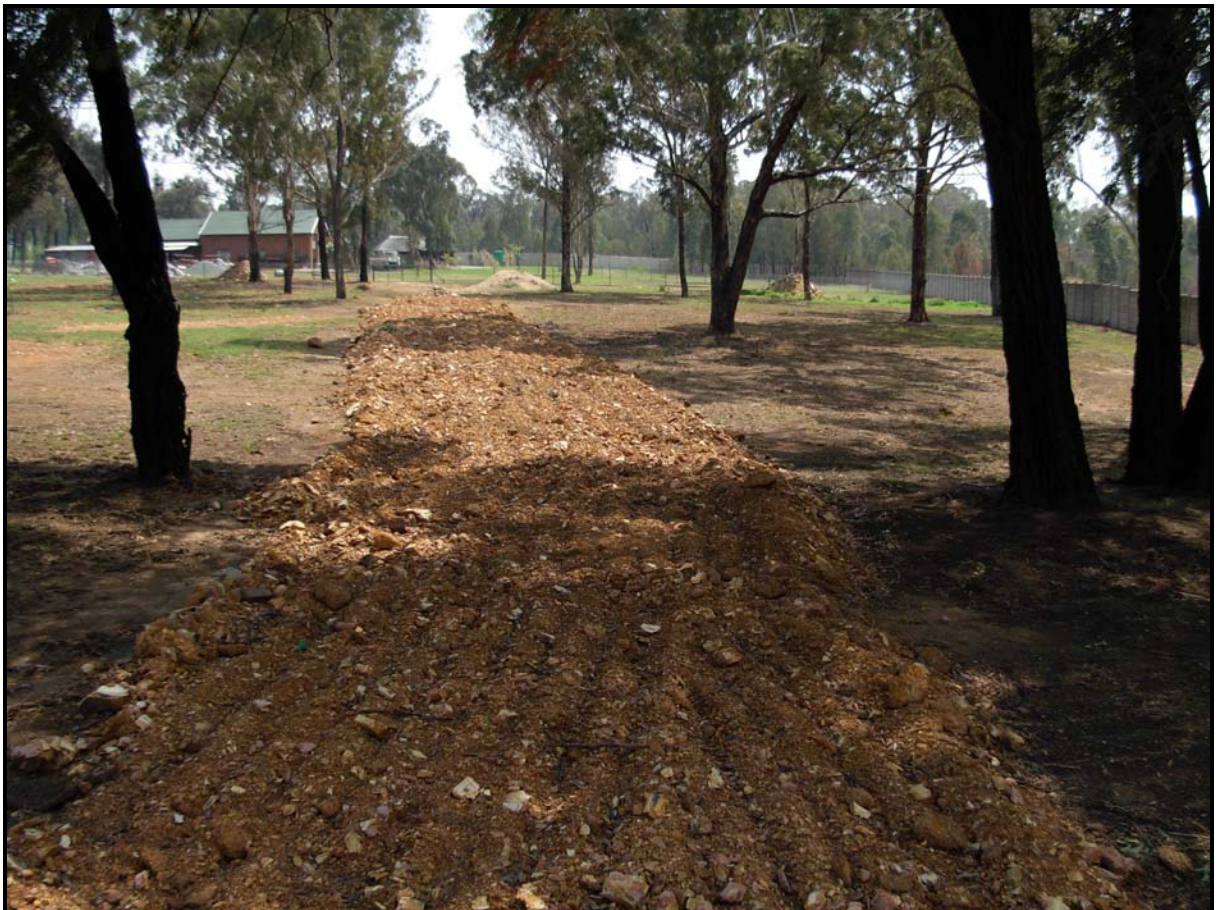
• Figure 1: General site photo (Buildings in back ground on AH19)

(Refer to Figure 1 for general view of property.)