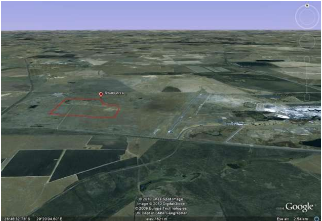
• Photo 2 The Study Area Landscape

Although this is a dominant landscape type for this area it is not an environment that is found aesthetically pleasing and it is recommended that the design of this development should not reinforce this type of landscape.