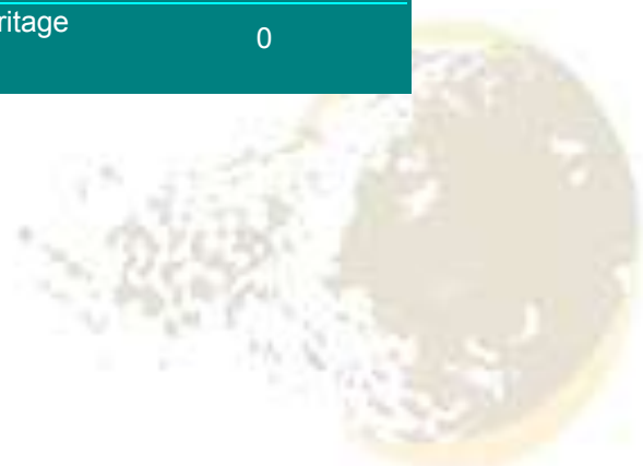
Table 2. Site significance table for post contact sites.