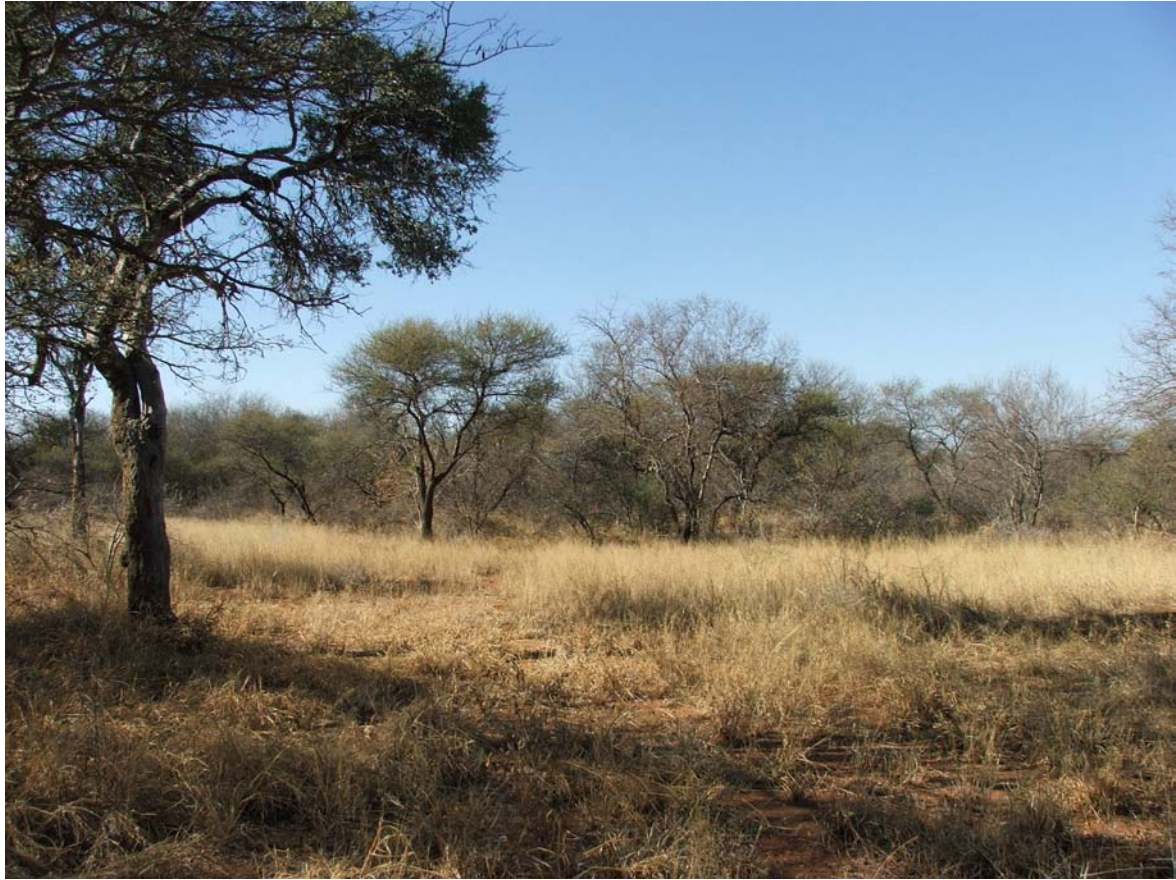
Photo 1. Proposed site for development.