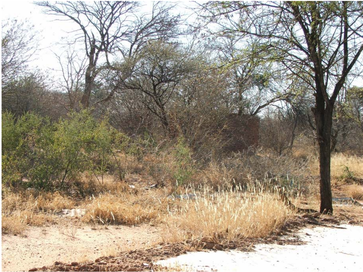
Photo 1. Proposed site for development.