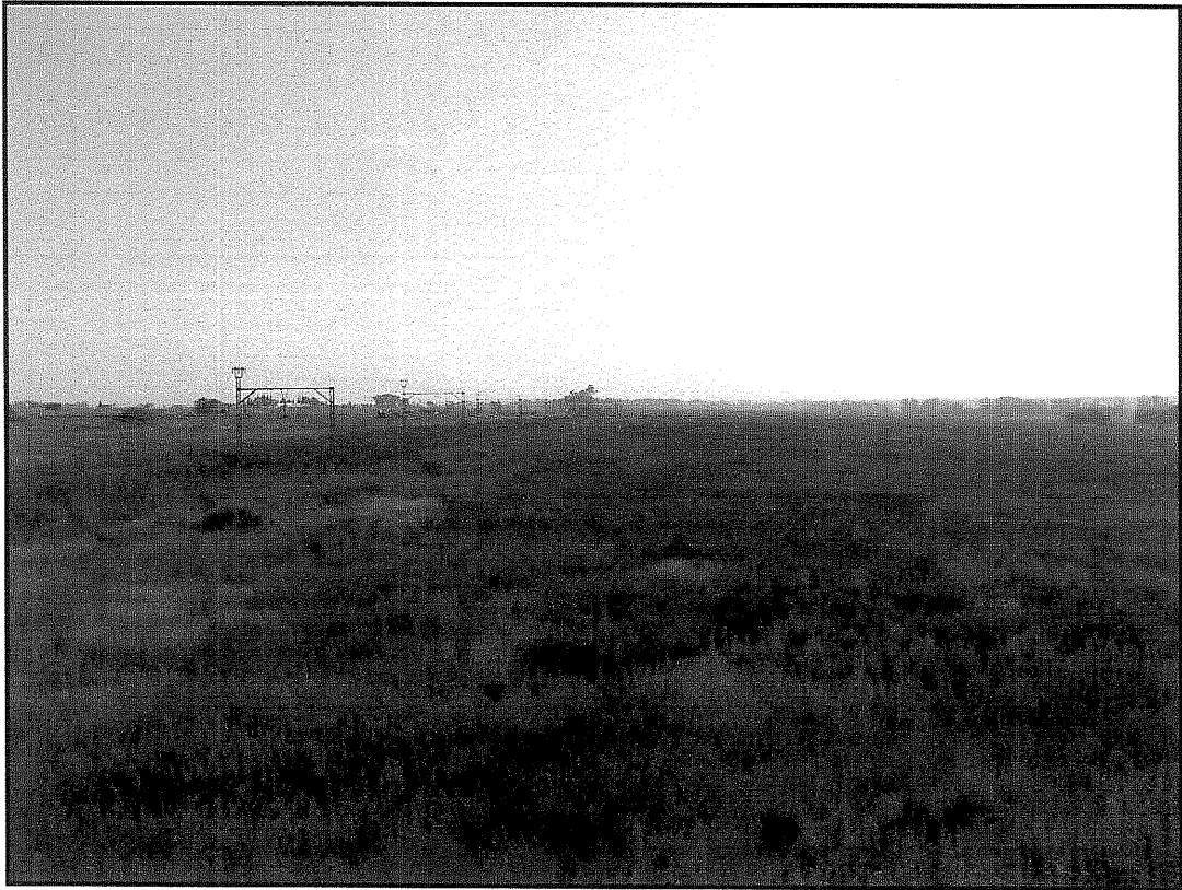
Fig. 3. Looking north at the route the pipeline would follow adjacent to the railway line.