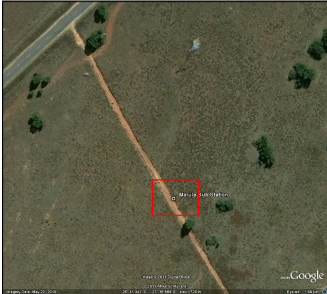
Figure 1: Google image showing the proposed sub station in red

The study area is highly disturbed by old diggings that would have destroyed any surface indications of heritage sites. The site is open and archaeological visibility is high. The study area is located at S26°11.367' E027°36.573' and no sites of heritage significance were identified during the survey.