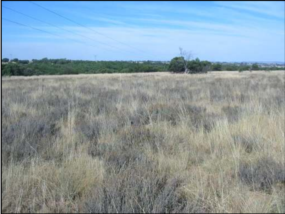
Figure 2: Site viewed from the north