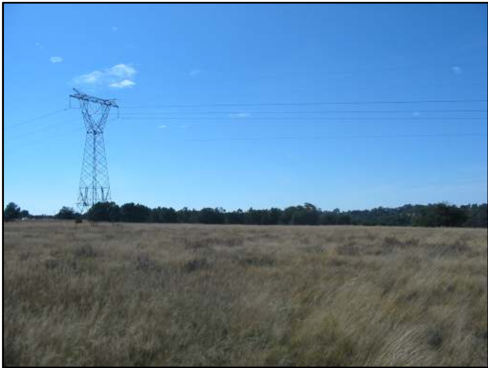
Figure 3: Site viewed from the north- east