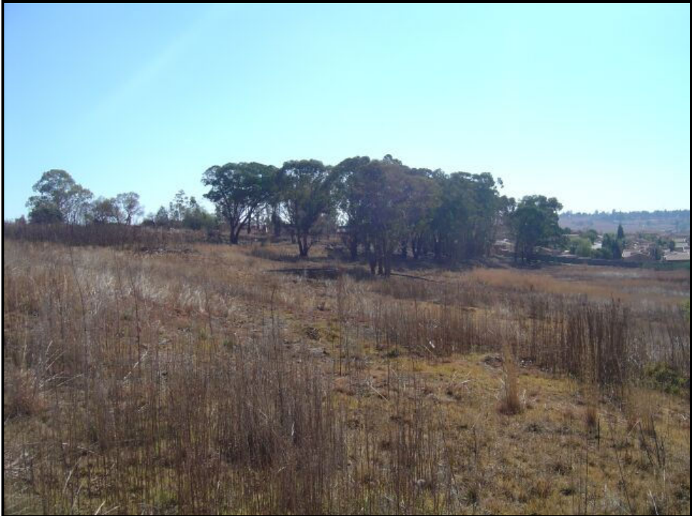
• Figure 2: General site photo