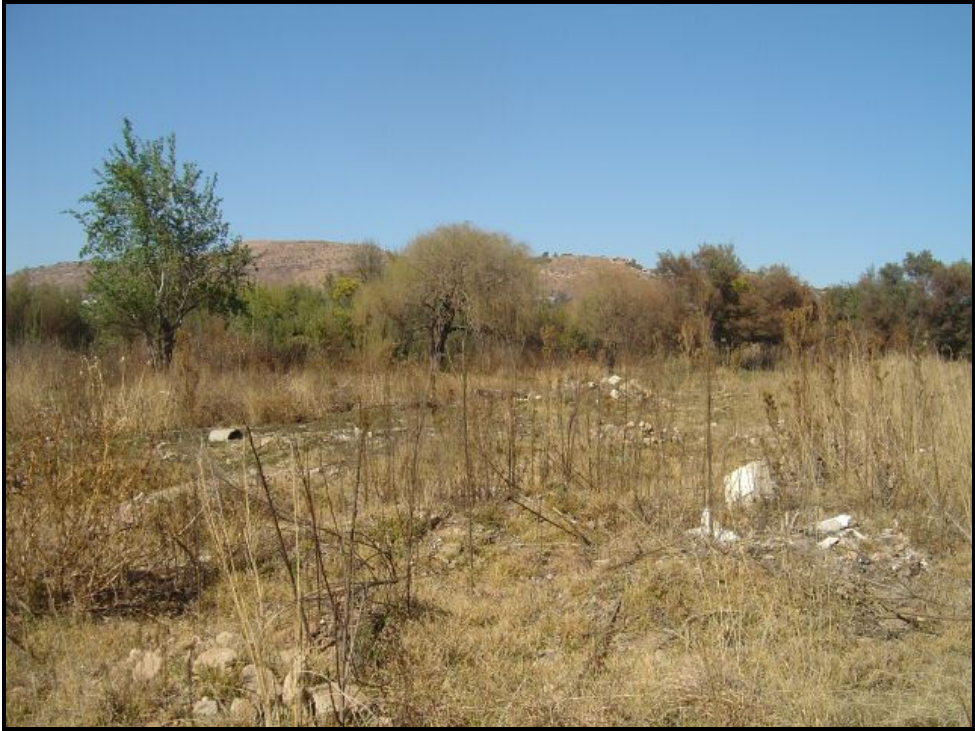
• Figure 3: Photo of demolished buildings