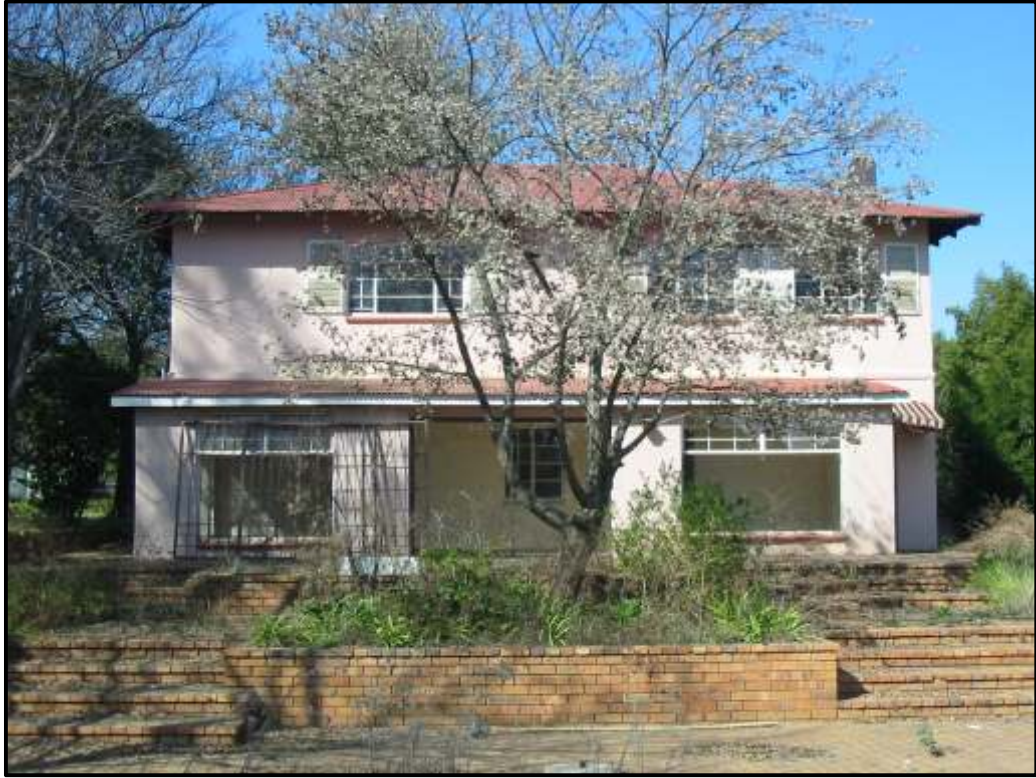
Figure 3: Residential dwelling