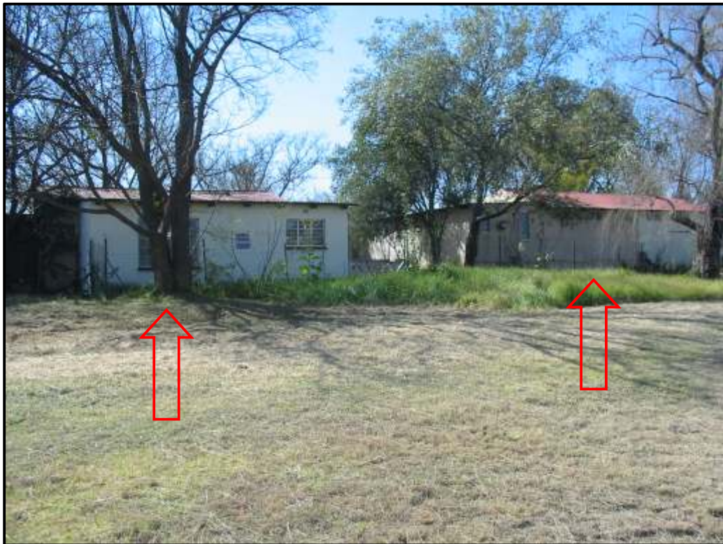
Figure 4: Two residential dwellings as indicated on the archival maps marked by red.