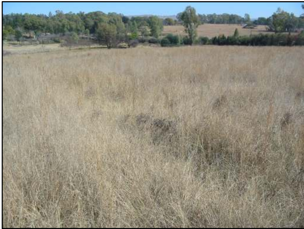
Figure 2: General Site Conditions

The existence of the two structures older than 60 years as indicated on the Archival Maps was verified during the field survey. They are located on the northern boundary of the development at Co-ordinates 26^{\circ} 04' 44.94''S 27^{\circ} 54' 03.77''E . Access to the residential dwellings was restricted how ever and it was not possible to examine these dwellings from the inside. No other heritage significant sites were recorded during the survey. How ever the presence of informal graves can not be excluded. A third dwelling of unknown age occurs on site at 26^{\circ} 04' 43.81''S 27^{\circ} 54' 00.37''E .