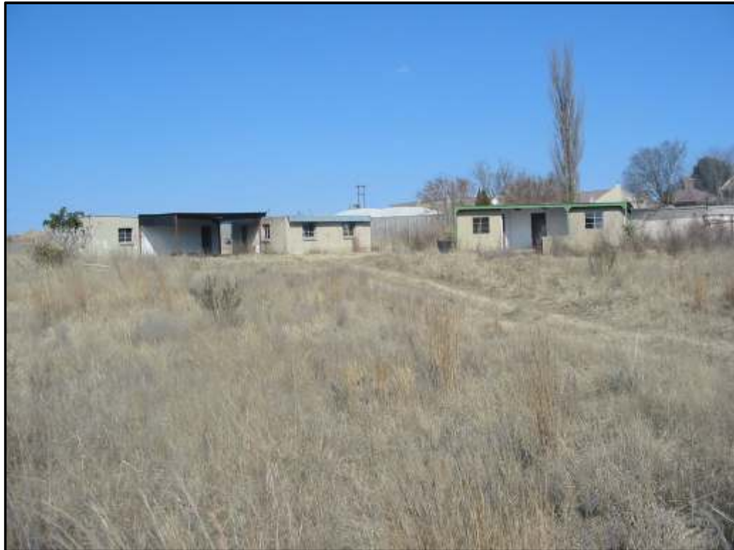
Figure 1: Dwellings on site

No heritage significant sites are located within the study area. The study area is disturbed by earth moving activities and three clusters of dilapidated buildings occur on the property. No archaeological material is exposed by ground moving. The buildings and structures on site are not older than 60 years and therefore not protected by legislation.