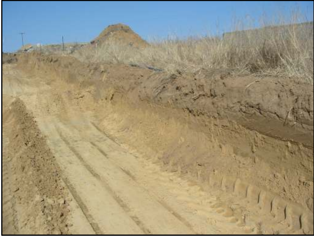
Figure 2: Earth moving activities exposed no archaeological material