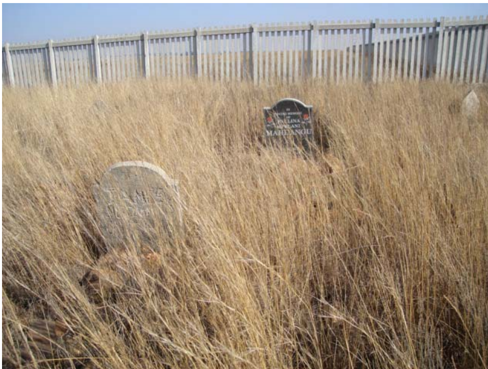
No. 2 The large cemetery just south of the proposed development area