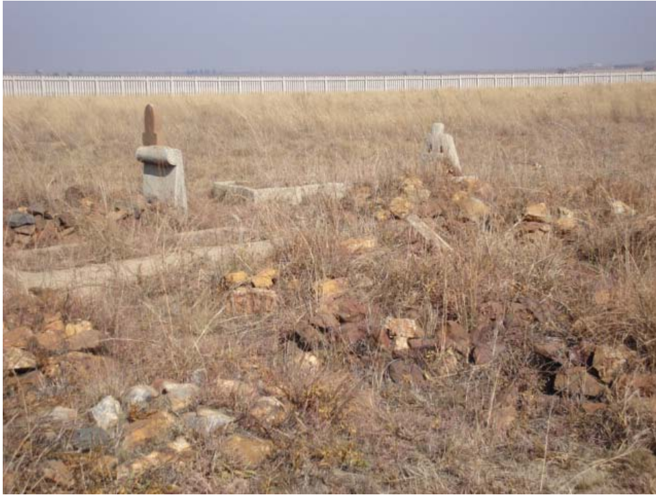
No. 1 The old cemetery in the proposed development area