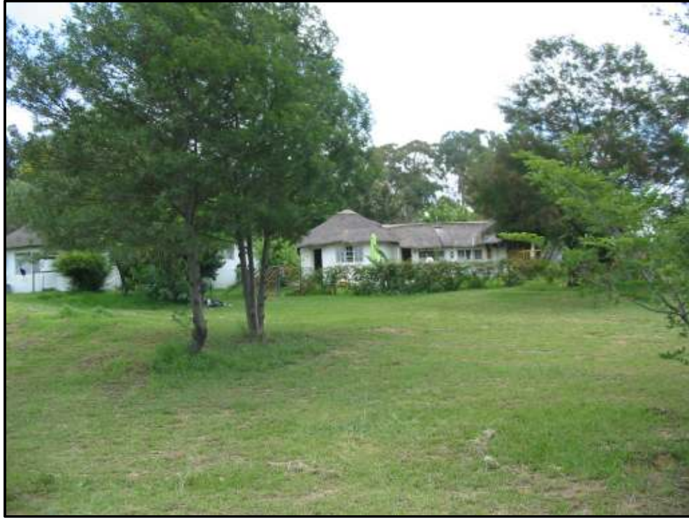
Figure 3: Residential dwelling