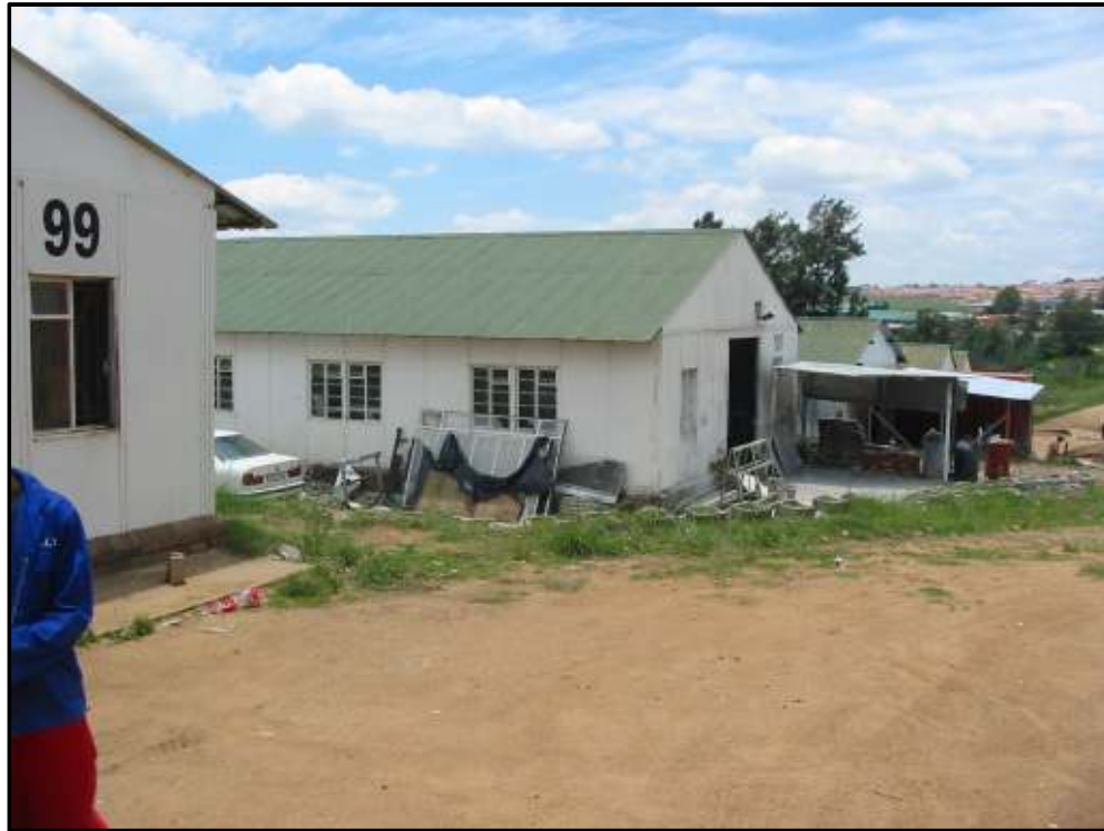
Figure 2: Workshops on site

Several residential dwellings and associated outbuildings occur on site. These buildings are not older than 60 years and therefore not protected by legislation. According to Ms. Agnus Molafou, a domestic worker on the property she is not aware of any graves within the study area. The area is further characterised by various buildings used as workshops.