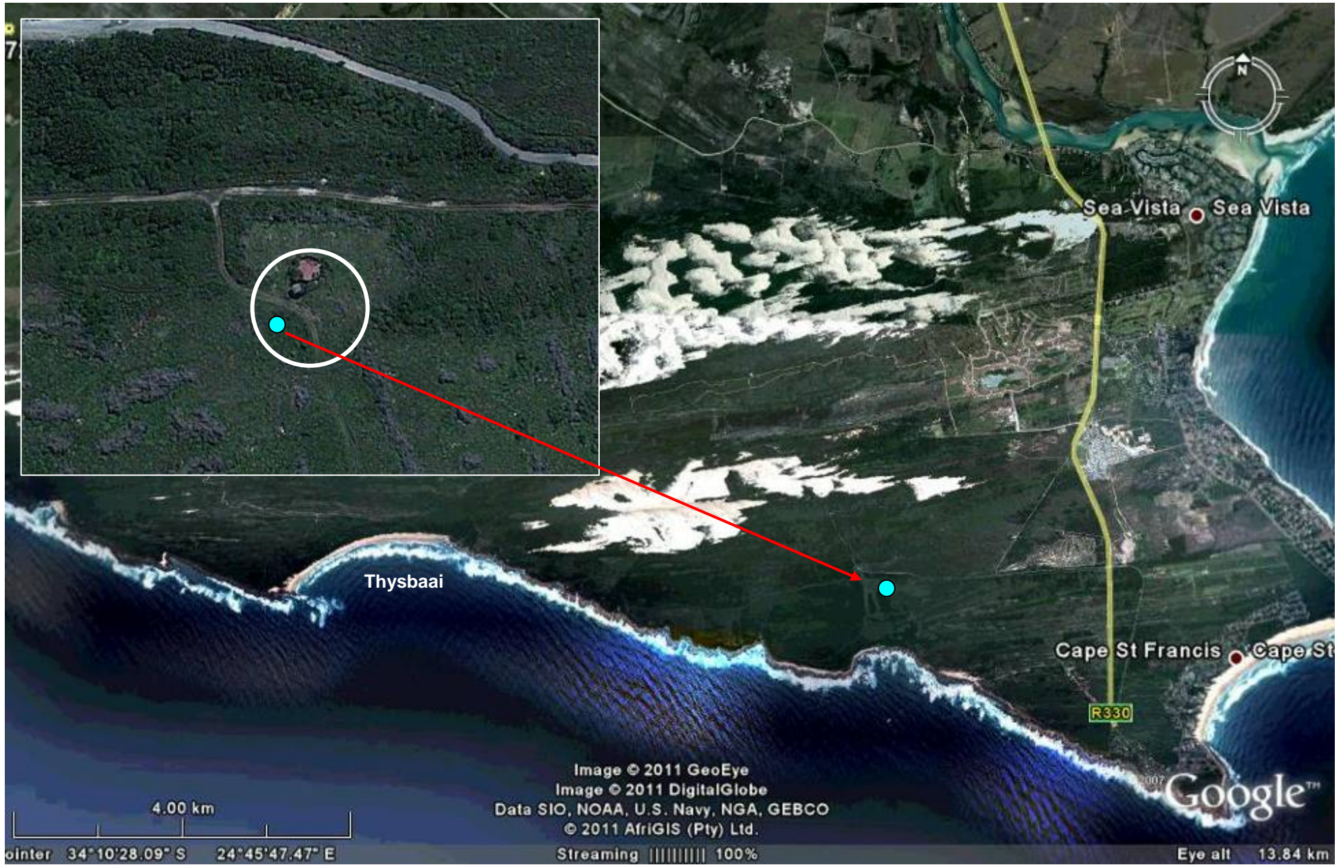
Map 2. Aerial images indicating the location of the proposed borehole (light blue dots).