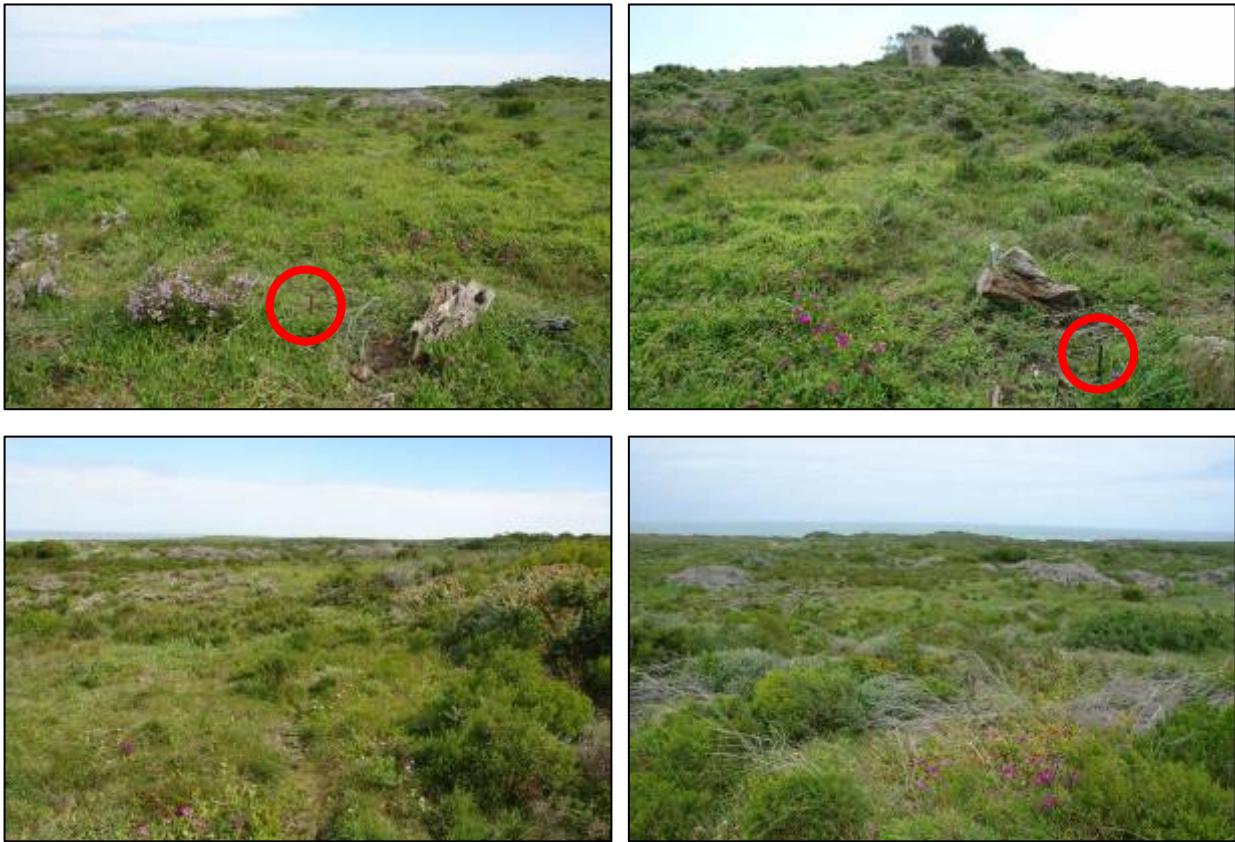
Figs 1-4. General views of the landscape and the proposed borehole location (marked by the red circles).

cleared of alien vegetation in recently years and is now also covered with dense grass and coastal fynbos which made it almost impossible to find archaeological sites/materials. No archaeological sites/materials were found and in general it is unlikely that any archaeological remains of any significance will be exposed during the drilling operation.