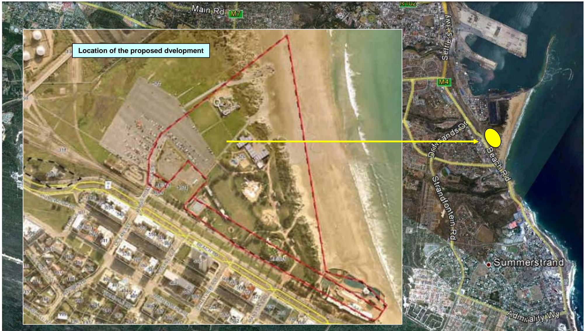
Map 3. Aerial images of the location of the proposed redevelopment and landscaping of the southern portion of the Kings Beach node on the Nelson Mandela Bay southern beachfront. The approximate size of the property is outline in red.