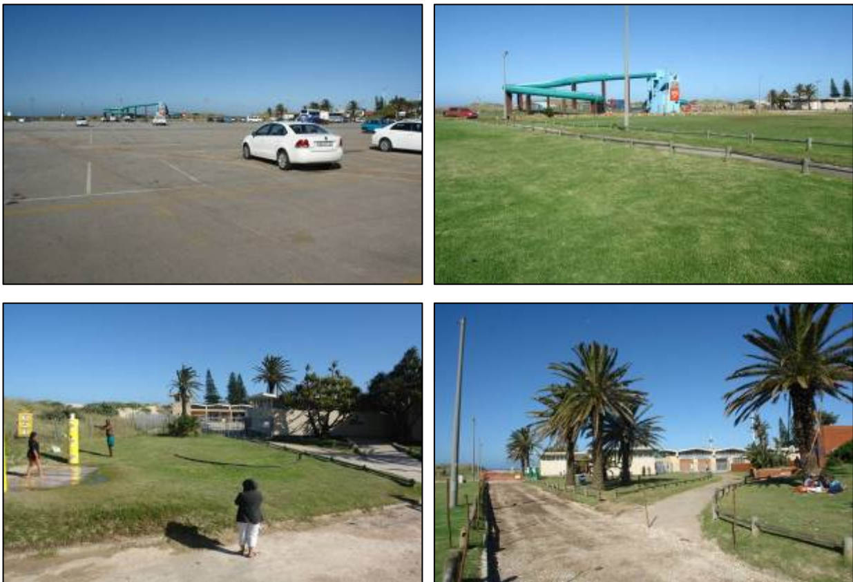
Figs 1-4. Different views of the proposed property for the phase 2 redevelopment and landscaping of the southern portion of the Kings Beach Node on the Nelson Mandela Bay southern beachfront. Note: the area has been extensively disturbed in the past and by current developments.

The investigation was conducted on foot. GPS readings were taken with a Garmin and all important features were digitally recorded. The proposed property for the development is situated between the beach and Beach Road and has been extensively developed in the past with parking areas, walk ways, lawns and a variety of buildings and other recreation facilities. The low dune along the immediate beach area was artificially constructed in the 1980s to allow visual connectivity between the park and the beach. Current construction activities exposed large areas previously covered by structures and features. This provided the opportunity to investigate these areas for possible archaeological sites/materials (Figs 1-8). No archaeological sites/materials were found and it is unlikely that any in situ archaeological remains will be exposed during the development.