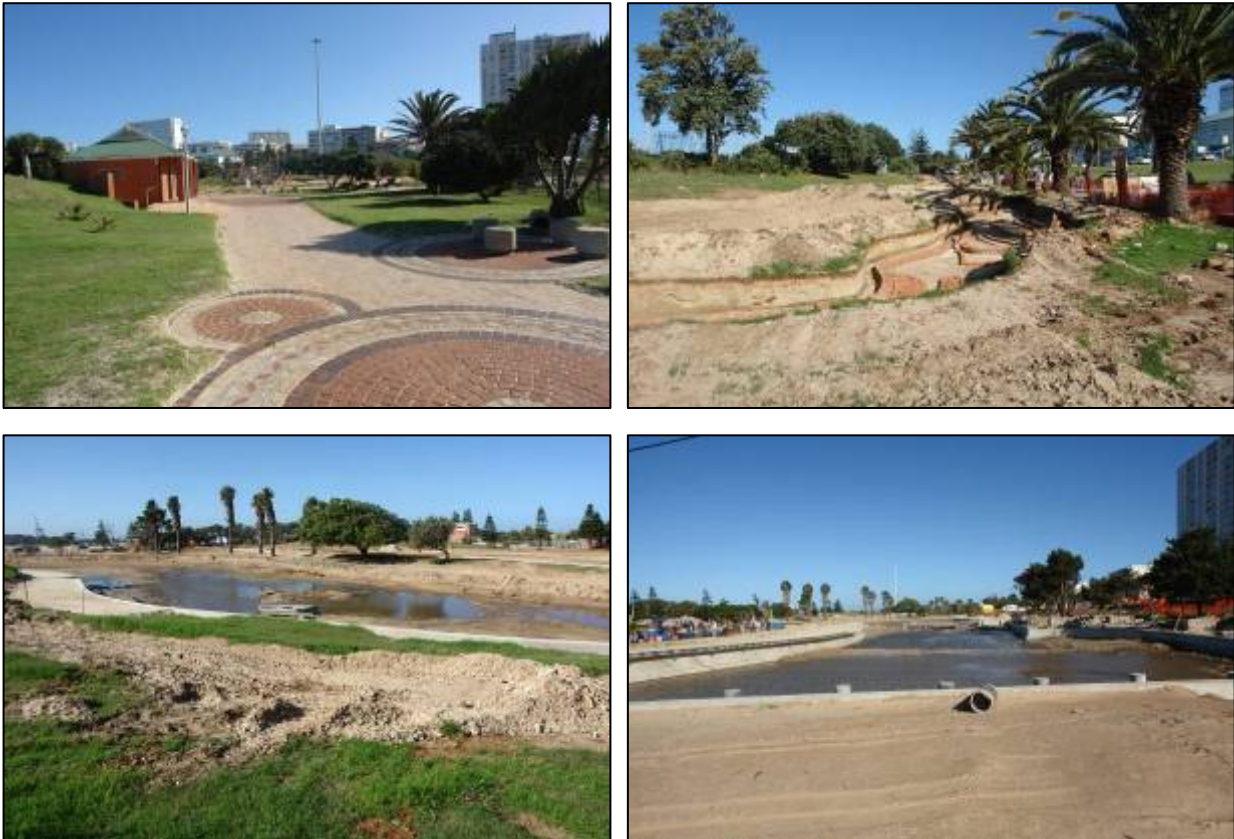
Figs 5-8. More views of the proposed property for the phase 2 redevelopment and landscaping of the southern portion of the Kings Beach Node on the Nelson Mandela Bay southern beachfront. Note: the area has been extensively disturbed in the past and by current developments.