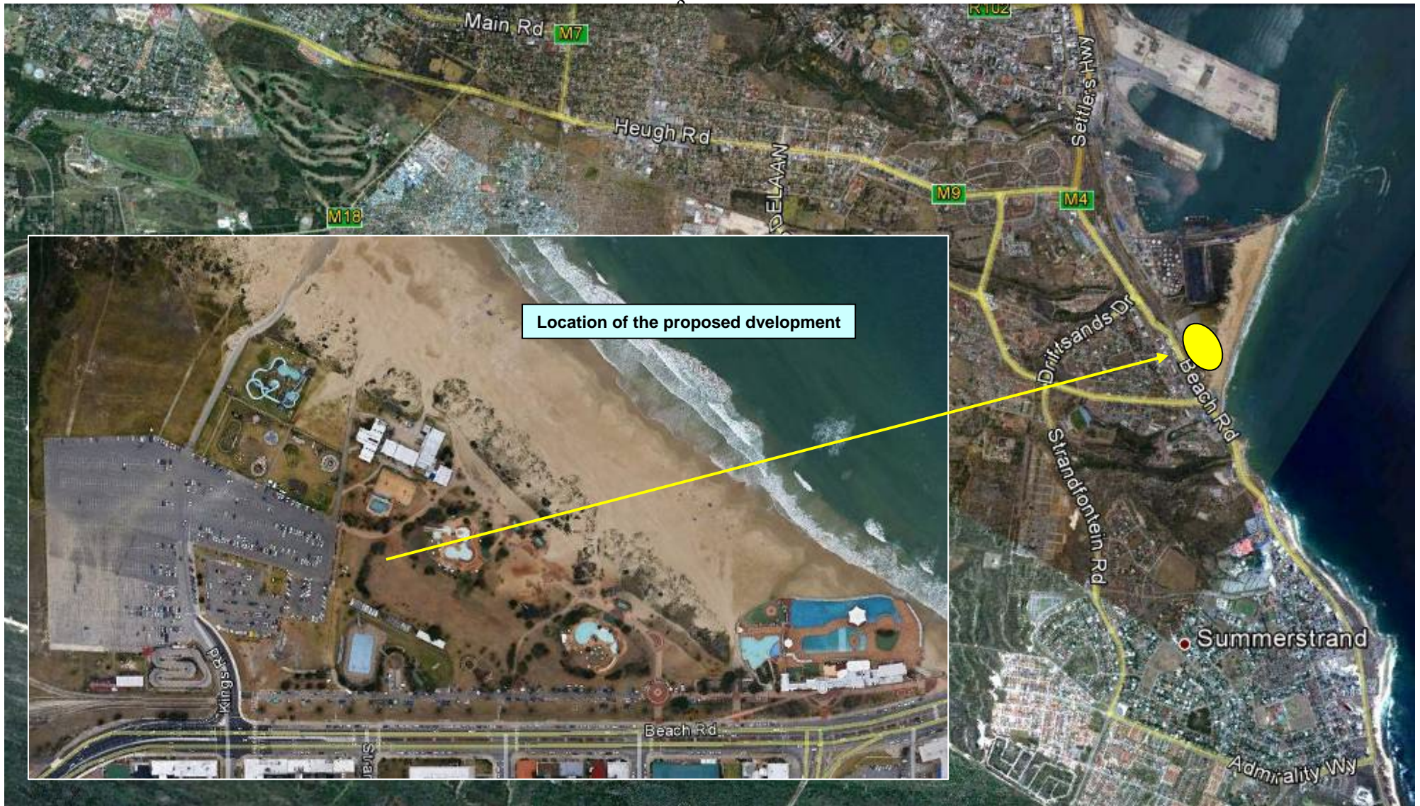
Map 2. Aerial images of the location of the proposed redevelopment and landscaping of the southern portion of the Kings Beach Node on the Nelson Mandela Bay southern beachfront.